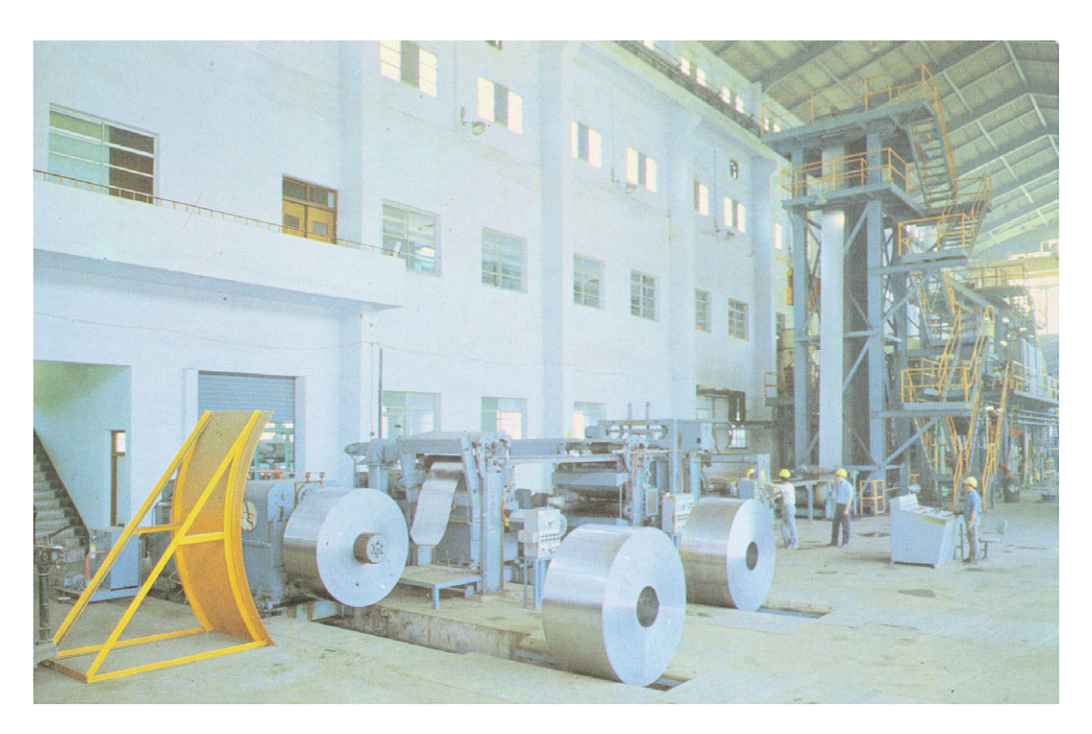
Figure 5. TMMC electrolytic tinning line. TMMC catalog Diandu maokoutiepi (1976), inside cover.

fishing vessels and engines, producing first smaller craft and then larger deep-sea boats in support of the finishing industry. This was then backed by the emergence of canneries engaged in packaging fish, as well as fruits and vegetables, for export. But canneries could only operate with a sufficient and steady supply of the tinplate required for packaging. Canneries also needed boilers to sanitize the cans. TMMC not only provided boilers and produced tinplate, but it also continued to invest in output and upgrading as demand soared. This supply gave birth to private tin-can makers, who emerged as product producers and machine manufacturers. <sup>79</sup>