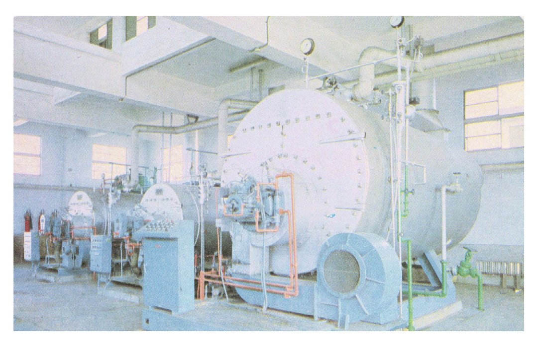
Figure 7. Package boilers like the one pictured here were manufactured at TMMC factories and transported to the end user. The TMMC catalog notes this boiler has 150hp. Taiji sa'nian (Tainan, TMMC: 1977), 74.

Taipower supplied the island with its electricity, and it relied on huge boilers generating over 90,000 pounds of steam per hour to do so efficiently. TSC made use of several large boilers to boil sugarcane and run centrifuges in the manufacturing of granular sugar; CPC needed a series of boilers running at different temperatures to refine oil and separate different elements in the distilling of petrochemical products. These last two firms made no small contribution to Taiwan's economy. TSC produced sugar, Taiwan's largest export, accounting for US$1.42 billion in foreign earnings from 1950–1970; CPC not only provided petroleum fuel but also the raw materials for the petrochemical industries. <sup>98</sup> Taipower, of course, kept on the island's lights.