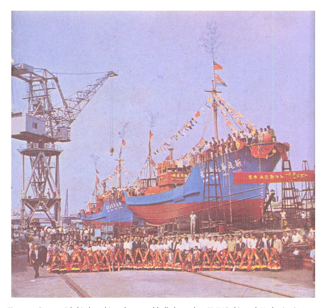
Figure 4. Ceremonial ship launching of two steel-hulled vessels at TMMC shipyard, Kaohsuing in 1969. Taji yuekan , 6.1 (Jan, 1970), cover.

TMMC to build passenger ships, timber ships, and cargo and tankers of up to 5,000 tons. To facilitate this project, the plan established a new TMMC shipyard in Kaohsiung to specialize in the manufacture and repair of large ships.<sup>75</sup> In short order, TMMC shipyards were turning out just under two dozen 250-ton vessels a day and had the capacity to manufacture ships up to 10,000 tons.<sup>76</sup> Among other signs of this success, and in accordance with the government export policy, it received an order in 1982 for 125 fishing vessels from Ecuador.<sup>77</sup>