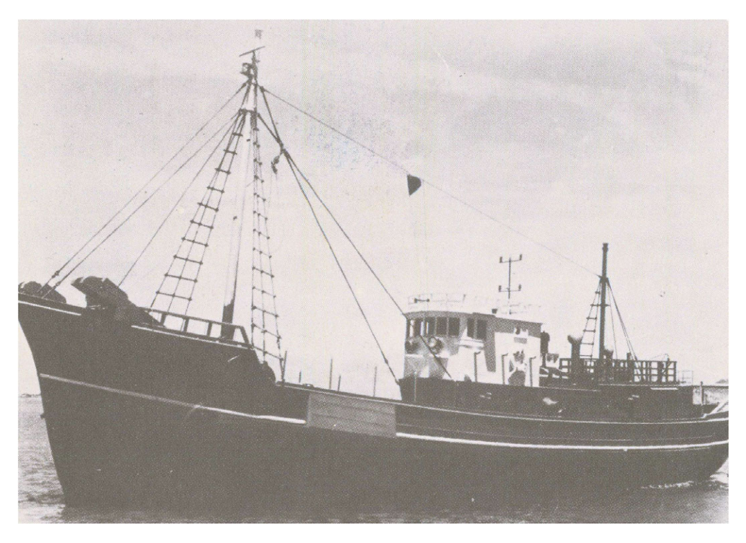
Figure 2. Wooden-hull fishing boats manufactured by TMMC c1950s. Taiji sa'nian (Tainan, TMMC: 1977), 105.

Lastly, an alloy mill was founded in 1969 and produced items of forged steel, such as generator shafts, piston heads, pinions, and propeller shafts, as well as rolled steel in the form of bars and stainless steel.