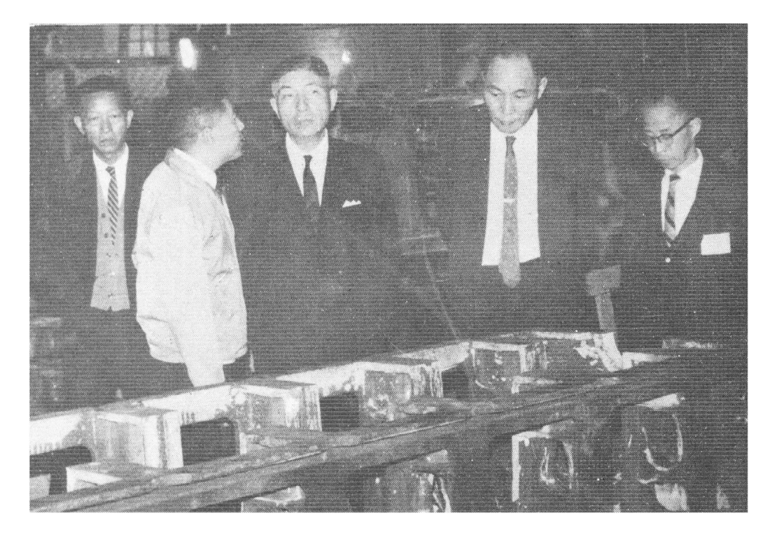
Figure 3. TMMC chairman Chang Ching-yu (second from right) and economics minister Li Kuo-ting (center) inspect diesel engine production at a TMMC factory in 1969 as part of a technology cooperation with Danish shipyard B&W. Taiji yuekan 4.2 (Feb, 1969), inside cover.