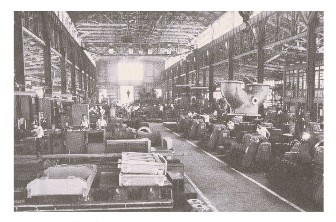
Figure 1. TMMC machine shop c1950s. Taiji sa'nian (Tainan, TMMC: 1977), 44.

By the time of Taiwan's rapid industrialization in the 1960s, TMMC had extensive manufacturing operations in numerous sectors. Often mobilized to undertake product development coordinating with manufacturing needs, TMMC grew to over 3,000 employees with multiple factory sites in Kaohsiung, including a machine works, foundries, and two shipyards.<sup>35</sup> The firm's multiple