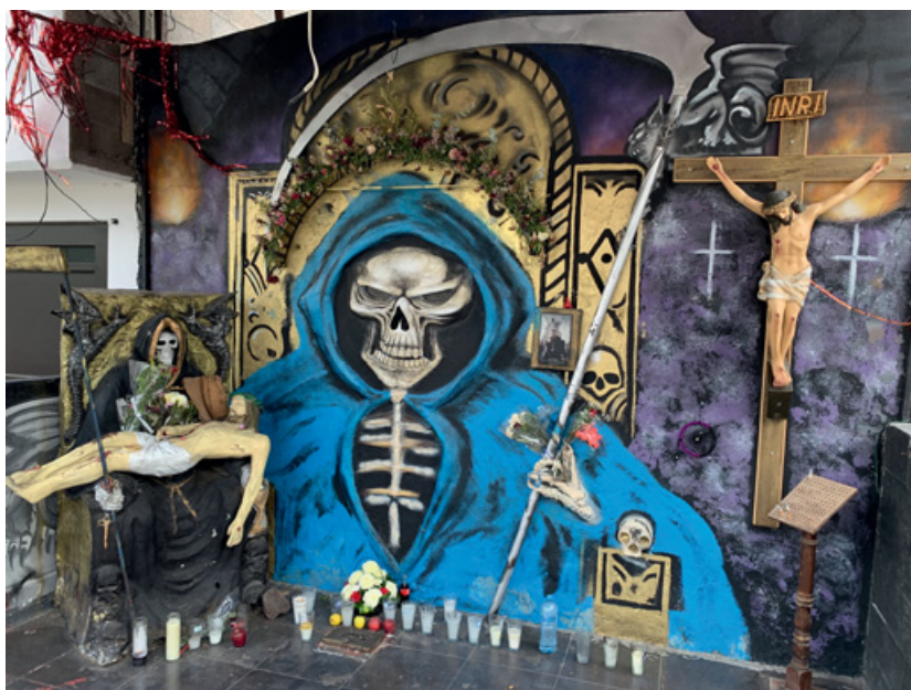
Figure 5 'Pietà' Santa Muerte, San Luis Potosí.

A final layer of Santa Muerte's iconographic lavishness is added by dressing up prefabricated statuettes. Building upon a long Catholic tradition to dress female saints during festive occasions, Santa Muerte devotees may decorate their images with gowns, jewellery, and wigs. For example, the main figure in doña Enriqueta Romero's famous shrine in Mexico City is renowned for her collection of gowns and excessively long hair. The acquisition of dresses or wigs is a way to express devotees' gratitude for a particular saintly intervention – or to formulate