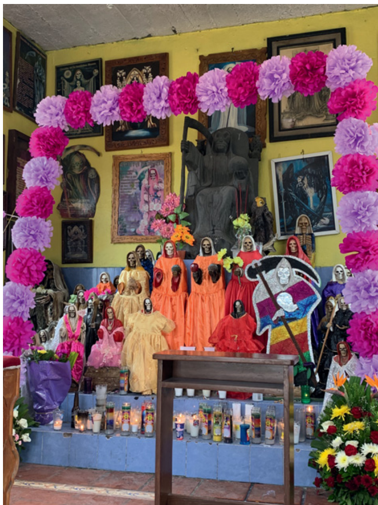
Figure 1 Altar in Capilla de la Santa Muerte, El Huizache junction, San Luis Potosí.

Several human-sized dressed statues line the yellow inner walls, which are covered with large, framed Santa Muerte posters. Some have photographs stuck on them of the devotees requesting Santa Muerte's protection. Unsurprisingly, quite a few are truck drivers, who spend weeks on the road away from loved ones, living on junk food and pills, risking accidents, robberies, or worse. A spectacular example of a tailor-made poster contains a Santa Muerte image on top of which a cut-out photograph of a chauffeur in front of his double truck is glued. The skeletal saint wears a white robe, her grisly skull, surrounded by an aureole, looks down on the driver. Underneath the image is a prayer. The