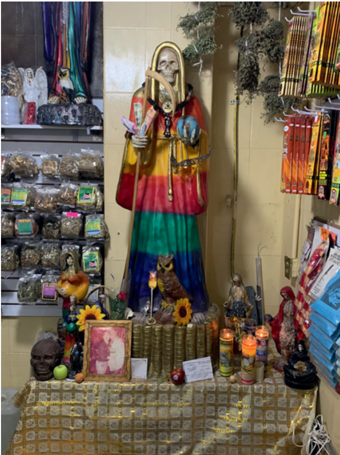
Figure 4 The multicoloured ‘seven powers’ Santa Muerte, Juárez market, Monterrey.

heart, a gold-coloured one for financial fortune, a green one for legal matters, amber for physical and mental health, and blue for professional well-being and wisdom. An entirely white figurine represents purification and is employed to discharge negative energies. The black Santa Muerte allegedly provides total protection, but some turn to her to inflict harm on others. Since devotees often face assorted challenges, the multicoloured Santa Muerte statue – known as the ‘seven powers’ – has become very popular (Figure 4). Colours are meant to steer Santa Muerte’s force in desired directions. 6 Some statues are painted with