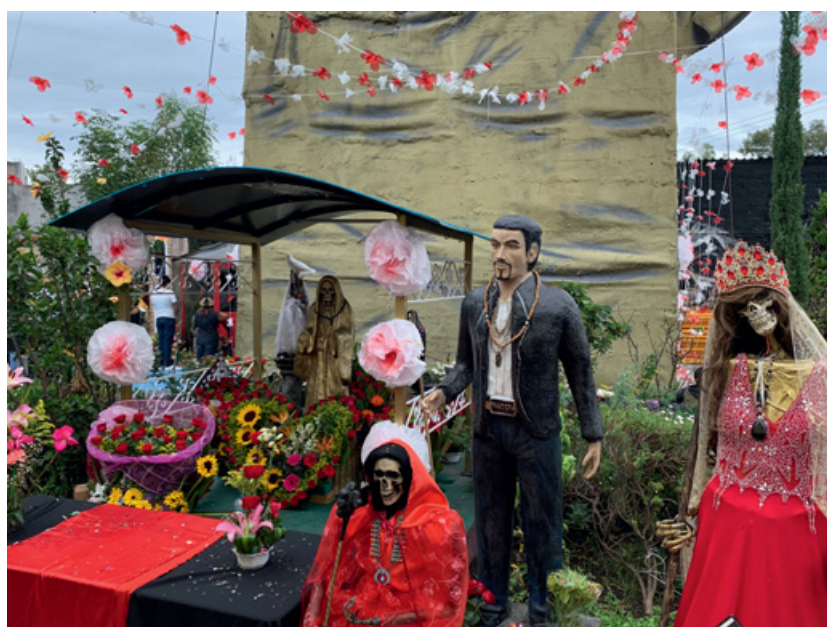
Figure 8 Comandante Pantera effigy at the Tultitlán shrine.