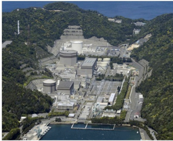
Fault under the Tsuruga reactor