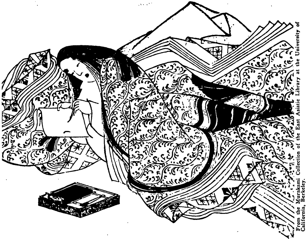
From the Murakami Collection of the East Asiatic Library at the University of California, Berkeley.