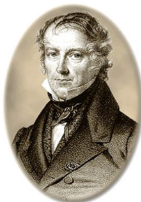
Jean-Baptiste Biot (1774-1862)

Although he was sometimes forced to create ingenious explanations to maintain his support of the corpuscular theory, Biot made significant advances in the study of optics. In 1815, he demonstrated that polarized light, when passing through an organic substance, could be rotated clockwise or counterclockwise, depending on the optical axis of the material. Further investigation showed that the angle of rotation was a direct measure of the concentration of the substance, which provided a simple mechanism for analyzing saccharine solutions. Biot's substantial research in the field of polarization also laid the groundwork for much of Louis Pasteur's work and established the science of polarimetry.