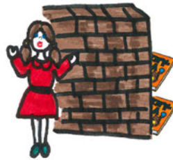
Fig. 1. Sample of pictures and accompanying descriptions used in the familiar noun study.

forms used in the familiar noun study (see Table A1). In the case of homophones (e.g., šaka 'branch' can be either 2.1 SNG NOM or 2.1 SNG INST), 200 entries at random were checked in context and the proportions applied to the total word count.