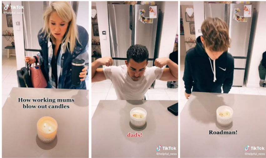
FIGURE 3. ‘How do you blow out a candle? Ask the family too?’.

This linguistic stylisation draws on numerous aspects of MLE, including the lexis fam , ahlie , the DP marker styll , and MLE vocalic and consonantal features. These features co-occur with a dramatically marked monotonic pitch and the swear-word fucking , which together evoke an aggressively confrontational stance. This stance is ideologically linked to the hypermasculinity that characterises the roadman and is strategically deployed to command the imagined addressee to clean their room.