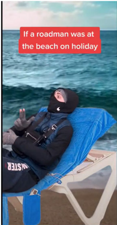
FIGURE 1. ‘If a roadman was at the beach on holiday’.

utilises cinematographic features such as voice modifiers, (unusual) props (e.g. a towel for hair), green-screen backgrounds, and other theatrical elements to ‘frame’ the performance. I refer to this type of performance as ‘theatrical stylisations’. Common to this category of video is that the roadman appears in hypothetical comedic situations, such as when he ‘goes to parents evening’ or ‘becomes a bus driver’. Examples are Figures 1 and 2 , where the roadman is recorded in two comedic vignettes: first, whilst he is at the beach on holiday, and second, whilst babysitting.