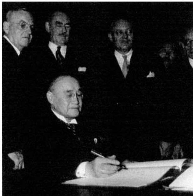
Yoshida Shigeru signs the San Francisco treaty

From signature of the trusteeship agreement until 1951, the islands of Micronesia were placed under civilian administration by the US Department of the Interior, except for most of the Marianas, which were soon returned to the Navy, and remained under Naval administration until 1961.[101] Some parts of the Marshalls also remained a closed area under Naval administration, and continued to be used for nuclear testing. The Northern Marianas, except Rota, were also closed, for use as a CIA training ground for guerillas to be landed in China.[102] However, in the whole Trust Territories of Pacific Islands (TTPI) consisting of more than 2000 islands, the number used for such military-related activities was very small, and there was no specific plan for using the others. For the USA, the greatest significance of the trusteeship was probably that it prevented enemies from using these islands' strategic potential.[103] The general public, including Americans, were not allowed to visit the islands, and inhabitants' travel overseas was also restricted.[104]