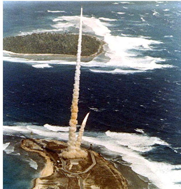
Kwajalein atoll test range

The governments of the FSM and the Republic of Marshall Islands (RMI) signed the Compact of Free Association in 1982, and it came into force in 1986. A major subsidiary agreement of the Compact with the Marshall Islands allows continued use for up to thirty years of the US Army missile test range at Kwajalein atoll. Although post-TTPI arrangements were made, the trusteeship was not terminated until 1990. By Article 83 of the UN Charter, the trusteeship status of a strategic area can be altered only by UN Security Council resolution. Denouncing the Free Association system as “new colonial rule”, not to mention the Commonwealth arrangement with the Marianas, the USSR regularly vetoed the trusteeship termination resolution.[120]