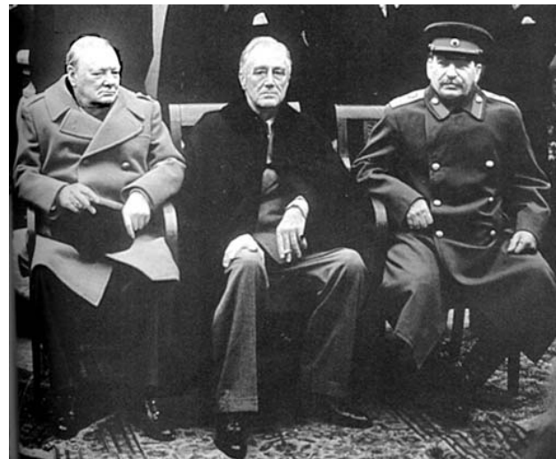
132. Winston Churchill, Franklin D. Roosevelt and Joseph Stalin meet at the Yalta Conference.

American occupation of the islands was complete before the Yalta Conference of February 1945. Beginning with invasion of the Marshalls, it was completed by a sweep through the northern Marianas by mid-1944.[4] Among agreements made at Yalta, relevant to the post-war disposition of these islands, were those on the UN and post-war trusteeship.