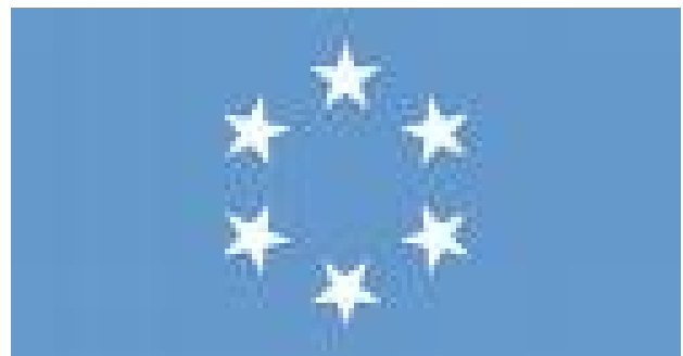
Flag of the Trust Territories of the Pacific Islands

US policy toward the TTPI changed radically in the 1960s. The Kennedy administration introduced the Peace Corps, and extended many US federal programs, especially in health and education, to the TTPI. Planning for the territory's future political status also began.[105] The major factor inducing this change in US policy was the independence movement of various UN trust territories that was developing then.[106] In 1965, the Congress of Micronesia was formed. Made up of representatives of the original six districts of TTPI (the Marshall Islands, Palau, Ponape, Truk, Yap, Saipan), it served for over a decade as the main agency of local self-government. In 1967 it established a Joint Committee on Future Political Status (JCFPS), which in 1969 issued a report recommending the TTPI's future status be that of a sovereign state. Following this report, the USA entered into formal negotiations to end the trusteeship and determine the islands' future political status. By 1975, with the independence of Papua New-Guinea, the other ten trusteeships created after the Second World War were all terminated. However, it took another fifteen years to terminate the TTPI.