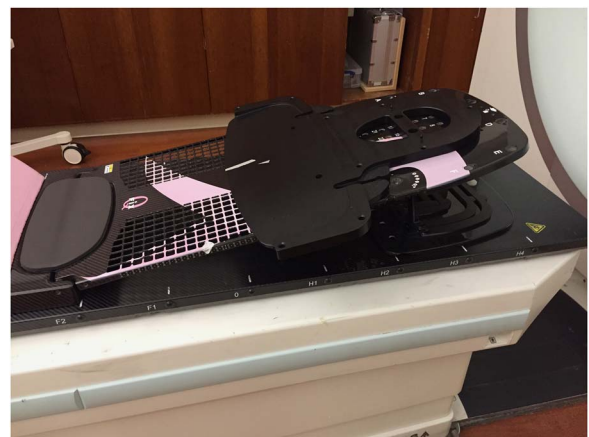
Figure 1. Tilting base board and head-and-neck adapter plate.

It was anticipated that a flat supine setup might be intolerable for the patient. Thus, it was decided to attempt simulation in both the flat and tilted positions to decide which would be more tolerable. The Access Supine Breast and Lung board (QFix, Avondale, PA, USA) was utilised for the base board (Figure 1). A prototype adapter plate, produced by the manufacturer and developed with our group, was attached to the top of the board. The adapter plate has pegs that fit into the tilt board to secure it in place and the adapter plate has the required holes to secure a full-length thermoplastic head-and-shoulder mask (Civco Medical Solutions, Coralville, IA, USA). The tilt board has a set of underbraces that produce various degrees of tilt up to 15°.