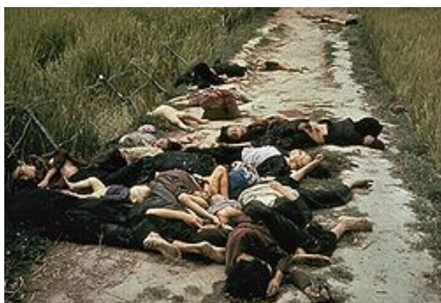
My Lai victims

In late 1969 Seymour Hersh broke the story of the 1968 My Lai massacre, during which US troops slaughtered more than 500 civilians in Quang Ngai Province, far north of the Delta. Some months later, in May 1970, a self-described "grunt" who participated in Speedy Express wrote a confidential letter to William Westmoreland, then Army chief of staff, saying that the Ninth Division's atrocities amounted to "a My Lay each month for over a year." In his 1976 memoir A Soldier Reports , Westmoreland insisted, "The Army investigated every case [of possible war crimes], no matter who made the allegation," and claimed that "none of the crimes even remotely approached the magnitude and horror of My Lai." Yet he personally took action to quash an investigation into the large-scale atrocities described in the soldier's letter.