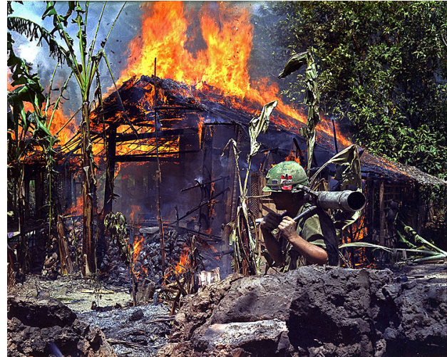
Burning a "Viet Cong base camp" in the Mekong delta, June 3, 1968 at Cai Lay

In this letter, and two more sent the following year to other high-ranking generals, the sergeant reported that artillery, airstrikes and helicopter gunships had wreaked havoc on populated areas. All it would take, he said, were a few shots from a village or a nearby tree line and troops would "always call for artillery or gunships or airstrikes." "Lots of times," he wrote, "it would get called for even if we didn't get shot at. And then when [we would] get in the village there would be women and kids crying and sometimes hurt or dead." The attacks were excused, he said, because the areas were deemed free-fire zones.