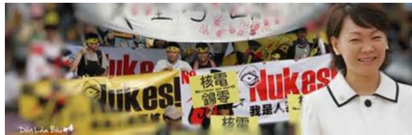
Akie Abe Supports Anti-Nuclear Movement

expertise while 24% are in favor. Even within the LDP, opponents (43.2) exceed supporters (40.4) of nuclear exports. (Japan Times 6/13/2013) The export sales drive is being ramped up even as 150,000 people remain displaced from their houses due to the Fukushima accident. Abe faces further opposition to his nuclear energy plans on the domestic front as his wife also opposes nuclear exports. She said, "It will be better to use part of the money spent on nuclear plants for the development of new energy and promote the sale of Japanese-born clean energy overseas." (Asahi June 11, 2013)