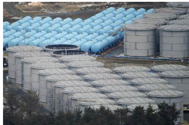
Fukushima Daichi site now covered with tanks for storing radioactive water

Tepco has adopted various strategies to store the flood of highly contaminated water and none have worked, and has only belatedly acknowledged that it is overwhelmed by the problem. (Asahi 8/3/2013; 7/23/2013) Contamination remains high because cracks in the reactor buildings and basements remain unrepaired. These areas are dangerous to access because radiation levels remain very high.