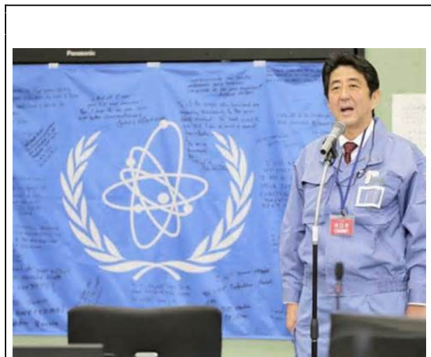
PM Abe talking to Tepco employees

from over and that entrusting the clean-up to the plant operator was a colossal mistake because it left critical decisions up to the industry insiders who compromised nuclear safety before 3.11 and subsequently mismanaged the crisis. Why, despite a cascade of media exposés about the water problem, did the government wait so long to intervene? And, why did intervention suddenly become so urgent?