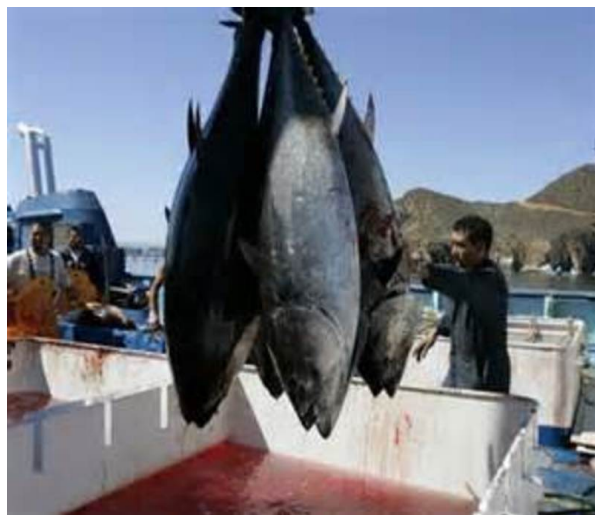
Fukushima's fishermen wonder if they will ever be able to resume their livelihood

caught off the coast of Fukushima had extremely high levels of radiation and since then there have been numerous reports about Tepco's bungled water management and failure to anticipate problems such as large volumes of groundwater flowing through the plant site that becomes contaminated as it mixes with water used for cooling. (NYT 4/29/2013) In June, the NRA voiced suspicions about plant leakages causing high radioactive readings in the adjacent ocean, but didn't act. (Asahi 6/26/2013) Subsequently, in July, the NRA stated that Tepco had no option other than releasing the tainted water into the ocean although calling on it to use purification systems to filter out radioactive substances. (Asahi 7/25/2013) Local fishery associations oppose the releases and remain skeptical about assurances that the processed wastewater is safe. They also worry about how these revelations about contaminated groundwater pouring into the ocean will sabotage their efforts to regain consumer trust.