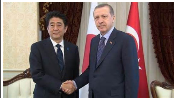
PM Abe Clinches $22 bn Nuclear Deal with Turkish PM Erdogan

exports of nuclear power plants. Toshiba owns 87% of Westinghouse while Hitachi and Mitsubishi have tie-ups with GE and Areva meaning that Japanese firms are major players in nuclear energy. Abe has become an active pitchman for Japanese nuclear technology, but if Japan begins phasing out its nuclear reactors, potential clients might look elsewhere. Abe's growth strategy calls for tripling infrastructure-oriented exports to $300 bn by 2020, and nuclear technology exports are key to achieving this target. Earlier this year Japan (with French companies) secured a long-term $22 billion contract with Turkey (a quake prone country). It has also signed a nuclear technology agreement with the United Arab Emirates and is eyeing sales to Brazil and Saudi Arabia. Negotiations are also ongoing with India to enable Japan to sell its technology there and Abe lobbied hard on behalf of Japan's nuclear exporters at a June 2013 central European summit of the Visegrad countries (the Czech Republic, Hungary, Poland and Slovakia) He also signed an agreement with France in June 2013 to deepen cooperation on nuclear exports. (The Diplomat 7/3/2013)