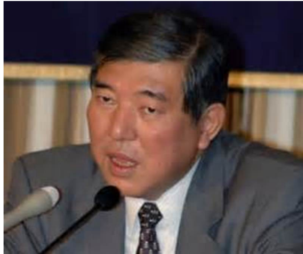
Ishiba Shigeru, LDP Secretary General, wants to keep the nuclear bomb option open