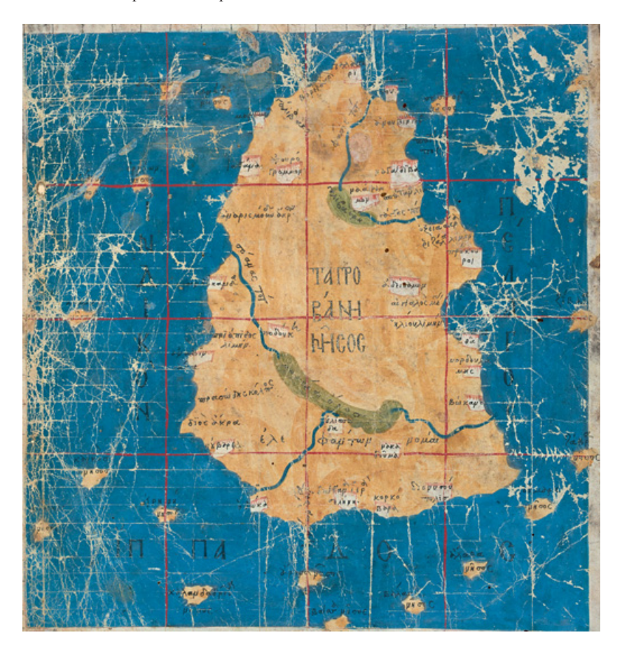
Figure 5.1 Map labelled 'Taprobana insula', with the lowest horizontal line representing the equator. British Library, Burney 111 flv. British Library.

Taprobane, including this map, were utilised on the island to tell stories of the resizing of Sri Lanka by repeated tidal waves, as part of the gods' judgement for bad government today.