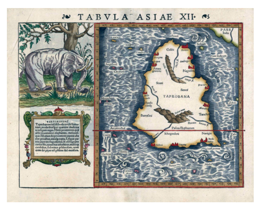
Figure 5.2 Tabula Asiae XII; hand-coloured map by Sebastian Münster, c.1552. From Ptolemy's Geographia universalis , 1540 ed., rev. & ed. by Sebastian Münster. Sri Lanka is labelled 'Taprobana' on the map, a name which was given to Sumatra on maps in later editions of the Geographia . MIT.

elephant's angry eyes and serpentine trunk immediately attract the reader's attention. The way in which this elephant is depicted is in keeping with earlier European mapping traditions which sometimes represent elephants as looking like wild boars with trumpet-like trunks. Ludovico di Varthema, who visited Lanka, is then cited. The island, we are told, 'exports elephants that are larger and nobler than those found elsewhere'. Taprobane becomes known here for its anomalous natural history; its unusual elephants make a stand on the map. The description from Varthema continues: 'Its yield of the long pepper is likewise richer, indeed wonderful in its abundance.' Soon the map was edited once again, and the elephant was made less fierce (Figure 5.3). Even while tracing the reverberations of Ptolemy's 'Taprobane' like this, one important caveat is that the idea, together with the knowledge of sailors and merchants