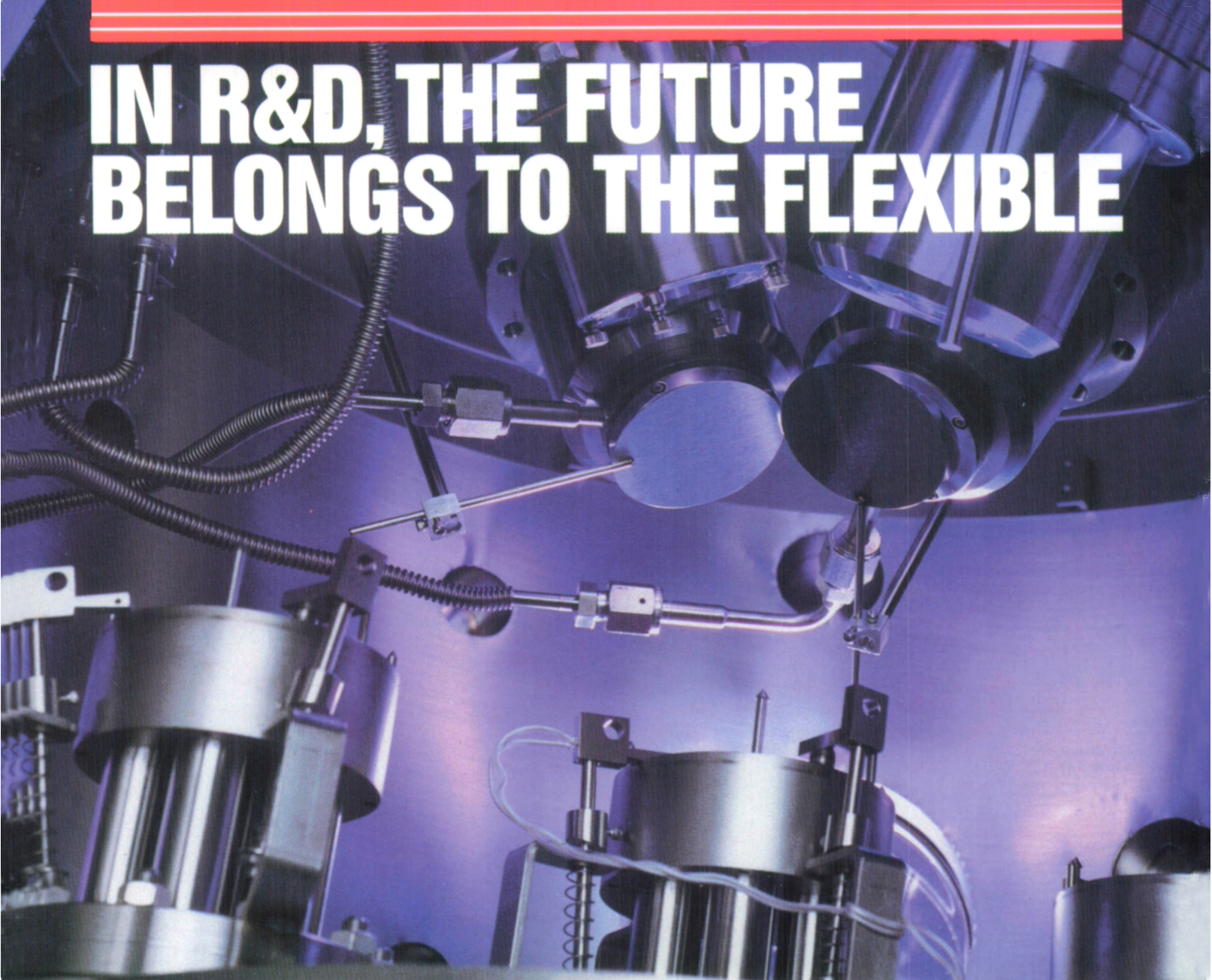
▲ A typical UHV internal arrangement for co-sputtering.