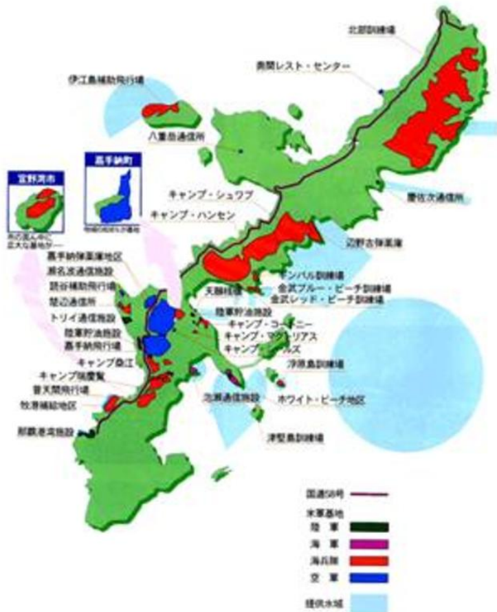
US military bases and installations on Okinawa. Areas in colors other than green are the sites of U.S. installations on land (red, orange, bright blue) and water (pale blue).

JASDF. Executive Response No. 6 states that it is inappropriate as well as impossible to specify their area. But the map prepared by the Ministry of Foreign Affairs (see below) shows approximate sizes of the areas designated as USAF training airspaces.