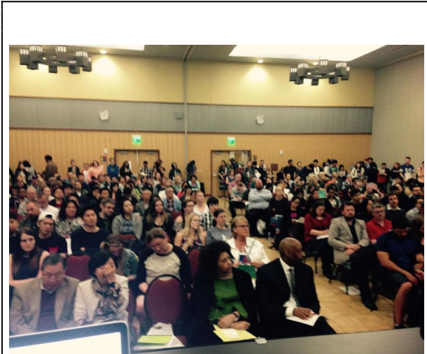
The audience of about 300 persons for the academic panel in the ballroom.

those coerced in sexual slavery as comfort women. Not because they are all the same, or can all be considered without regard to measures of complicity, but because they all demand our sustained attention if we have any hope of escaping the cycles of revenge and mutual recrimination that still seem to plague the Asia-Pacific seven decades after the war's end.