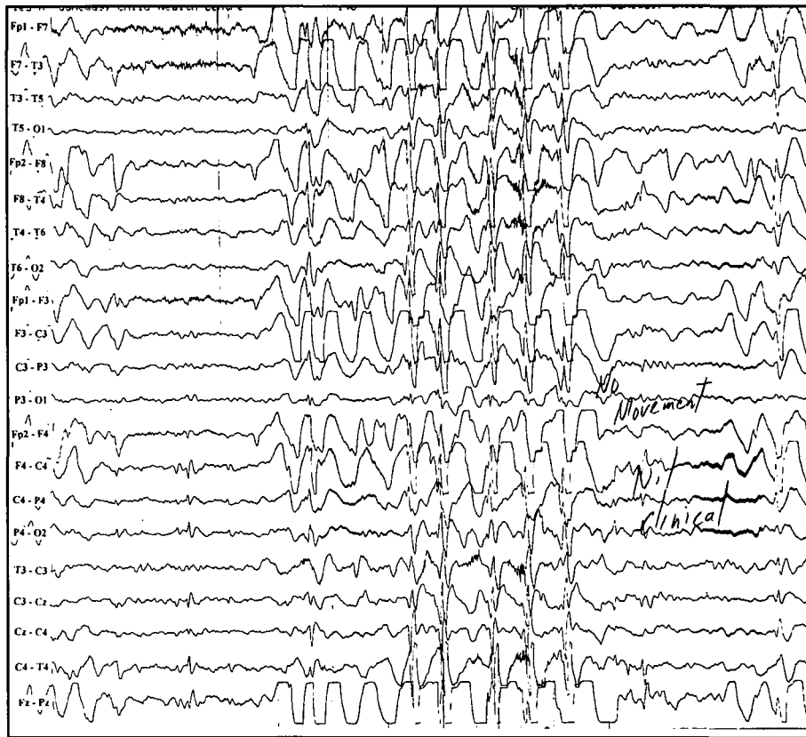
Figure 3: (Patient 13, Table 3) This tracing was obtained during behavioral and developmental regression reported while on treatment with CBZ. Nearly continuous focal right frontal and generalized spike wave paroxysms are seen. Vertical lines are 1 sec apart. The recording was obtained at a sensitivity of 7\mu\text{V}/\text{mm} .