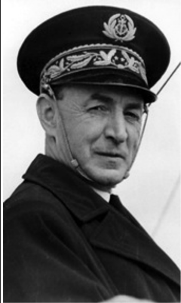
As France's High Commissioner in Indochina, Admiral d'Argenlieu supported the overvaluation of the piaster to strengthen France's ties to Indochina. Source

officials was the flooding of Vietnam with consumer goods imported by Chinese merchants. Excessive imports put pressure on the value of the piaster, which the French were trying to boost. To curb imports and protect the piaster, French authorities in October 1946 established a customs house in Haiphong, the main northern port. Not by accident, this unilateral assertion of French authority also had the effect of denying customs revenues to Ho's government. The Viet Minh cried foul, claiming that the French had violated terms of the March 6 accord. The customs dispute, which now raised fundamental questions of political sovereignty and nationalism, triggered street fighting in Haiphong on November 20. Commissioner d'Argenlieu, who never accepted the premise of a peaceful devolution of power to the Vietnamese, had been looking for just such an opportunity to strike back against Ho Chi Minh and his supporters in the North. The French military launched a savage naval bombardment of the port, killing several thousand civilians. Military officials in Indochina suppressed news of the massacre. They also held up transmission of a telegram by Ho Chi Minh to French Premier Léon Blum proposing a peaceful compromise. Hearing nothing back from Paris, Viet Minh forces attacked the French, killing about 40 soldiers and capturing about 200. When French military forces counterattacked throughout Tonkin, there was no turning back from war. 11