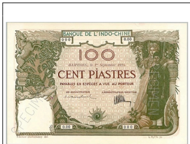
100 Piaster note, circa 1925.

Under cover of the British military campaign to suppress the Viet Minh, the French began reasserting administrative control. As one of his first moves, the new French High Commissioner in Saigon, Admiral Georges Thierry d'Argenlieu, proposed setting a high value on Indochina's currency, the piaster, to demonstrate France's resolute commitment to the colony. In December 1945, the French government pegged the rate at 17 francs to the piaster—far above its prewar value of 10 francs. 3