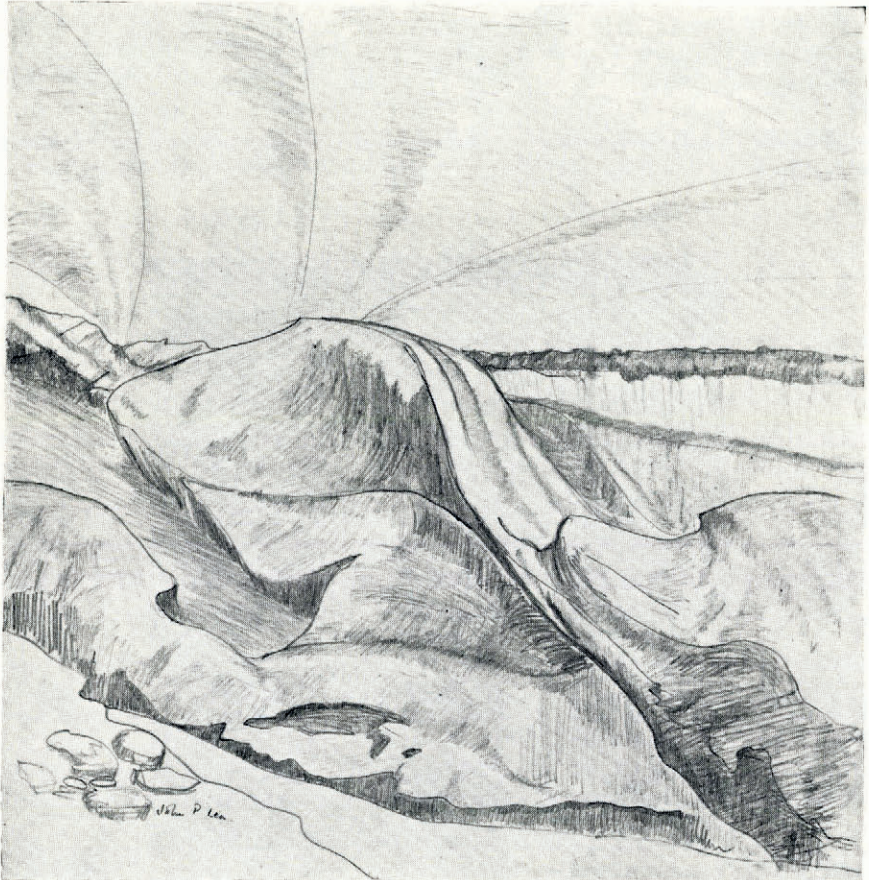
Fig. 3. Sketch of deformed and stagnating basal ice, 10 August 1961. The spiralling basal ice has rotated through an angle of about 130^\circ . Ice once in contact with the cave floor (right) has twisted so far as to face towards the roof (left)