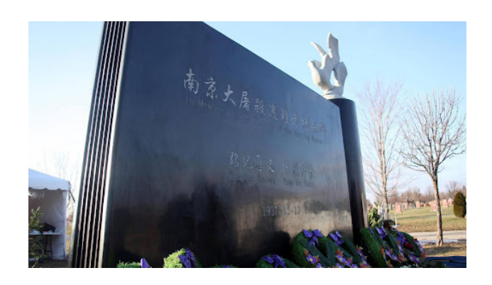
Image 2. Nanjing Massacre Victims Monument at Elgin Mills Cemetery in Richmond Hill, Ontario during its 2018 unveiling.

"anti-racism; education; heritage; monument; community and culture; and especially seniors' health and wellness" (BC Redress 2022b).