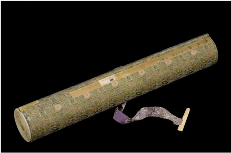
Figure 2. Guwantu (detail).

Moreover, the scroll features an ivory clasp and a strap of white and purple brocade with floral and cloud patterns. Two wooden rolling pins at the beginning and at the end of the scroll are decorated with roll ends of green dyed ivory with dragon motifs. The frontispiece is made of white paper and white silk brocade with phoenix and cloud patterns. In the two surviving copies, neither a preface or a table of contents, nor colophons or dedications have been preserved. These are likely to have been found in the lost first individual scrolls of the respective sets (Figure 2).