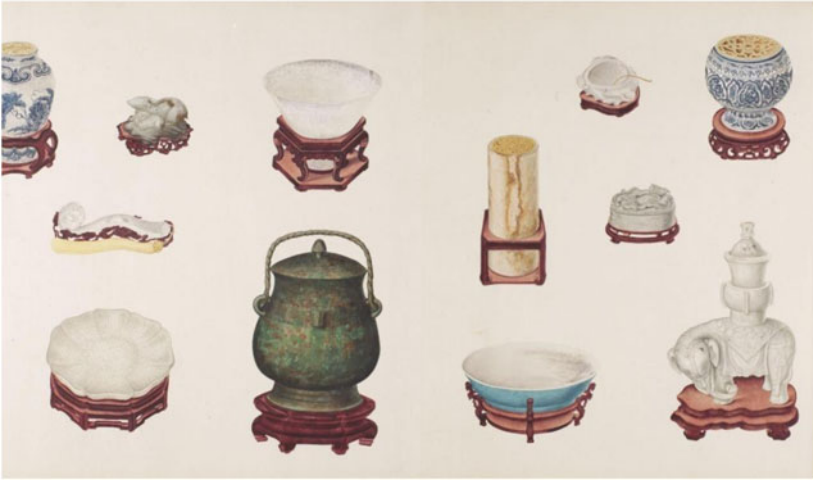
Figure 1. Guwantu (detail).

Scroll B/C.8–V&A presents itself as a mounted hand scroll with dimensions of 64 cm × 2648 cm and depicts a total of 262 objects including the same number of racks, stands, mounts or suspensions framing and re-contextualising the objects within the collection, plus an additional fifteen cabinets and cupboards for storage (Figure 1). 16