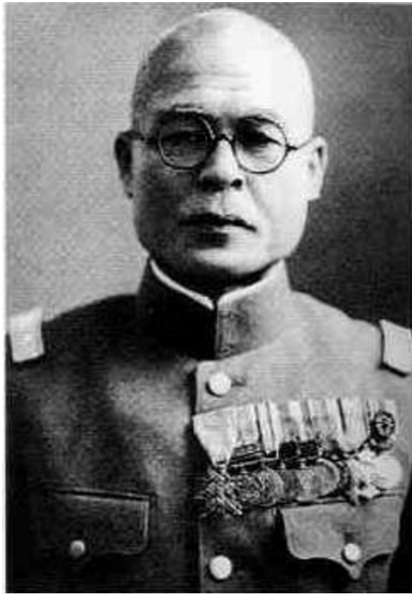
General Yanagawa Heisuke

Lt. General Yanagawa Heisuke [1879–1945] was one of the senior members of the “Imperial Way faction” in the Imperial Army. The domestic aim of these ultra-rightwing nationalists was the complete eradication of the remaining elements of Japanese democracy; the adoption of national socialist economic policies similar to the Nazis; and the restoration of full political power to Emperor Hirohito. As for foreign policy, they fully supported the expansion of the Japanese colonial empire, yet believed the Soviet Union was Japan’s principal enemy due to its promotion of communism. 6