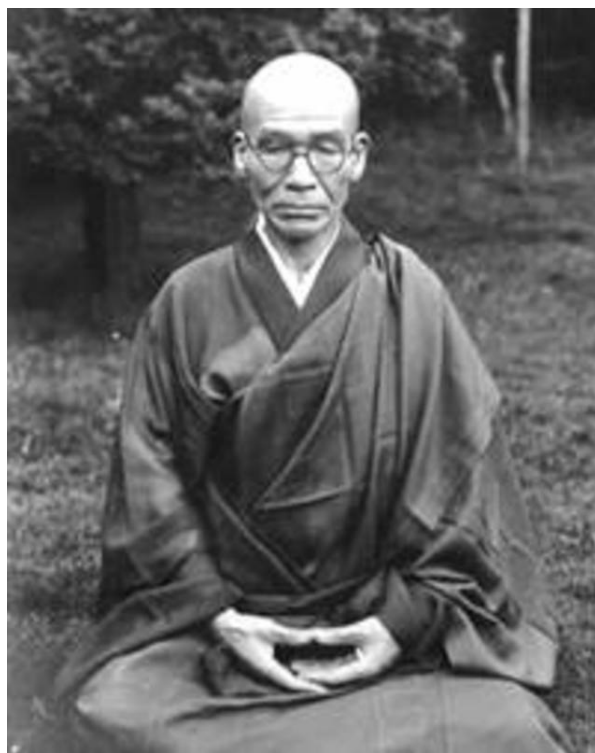
Sawaki as a priest

Another major difficulty is similar to one experienced in Germany following the Nazi’s defeat, i.e., few Germans were willing to admit they had once staunchly supported Adolf Hitler. Many Postwar Germans went to great lengths to hide their wartime complicity. Similarly, in postwar Japan few have been willing to admit they once supported Japanese aggression directed against the peoples of Asia. Even today, some Japanese political leaders dismiss the very idea of any Japanese wrongdoing. The