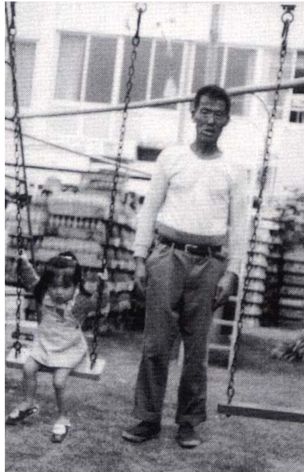
'Uncle' in Kumamoto

When 'Uncle' died, he had virtually no possessions. He left behind a pair of gumboots encrusted with food scraps and pig dung, and a jar containing a few cigarettes. As I gazed at them, I asked myself over and over again what 'Uncle's' life had been, indeed, why on earth he had even been born. An exile from his homeland, 'Uncle' had lived out his life quietly in the shadows. When he was suddenly felled by a stroke, he tried to brush away the helping hands, surely signalling that he had had enough of living.