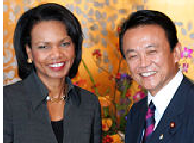
Rice in Japan with Foreign Minister Aso Taro.

Thus, via this last factor, the United States has continuing and unique ability to influence Pyongyang’s decision on when and if the DPRK conducts more nuclear tests.