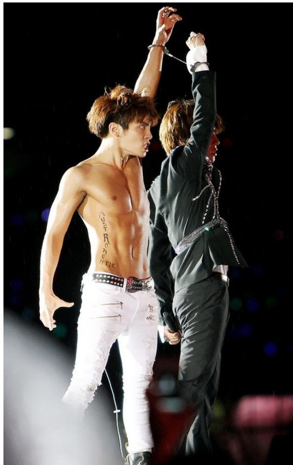
Jonghyun and Taemin performing, August 18 th , 2012 in Seoul (SM Town Live World Tour III).

do bow out of fame, choosing to escape from an industry that seems poised to destroy them. For example, 2NE1's Park Bom, B2ST's Jang Hyeonseung and AOA's ChoA have all retreated from the public eye. A few successfully re-enter the ranks of idol stars, like Sunmi who left the Wonder Girls to attend university in 2010, re-entered the group in 2015, and had a highly successful solo debut in 2017.