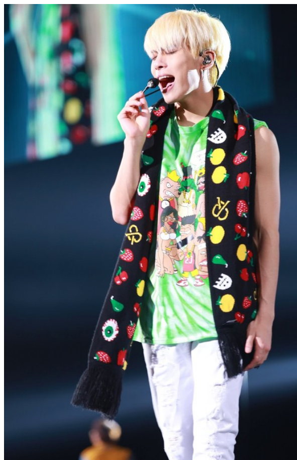
Jonghyun singing in Taiwan, May 11 th , 2014 (SHINee World Concert III).