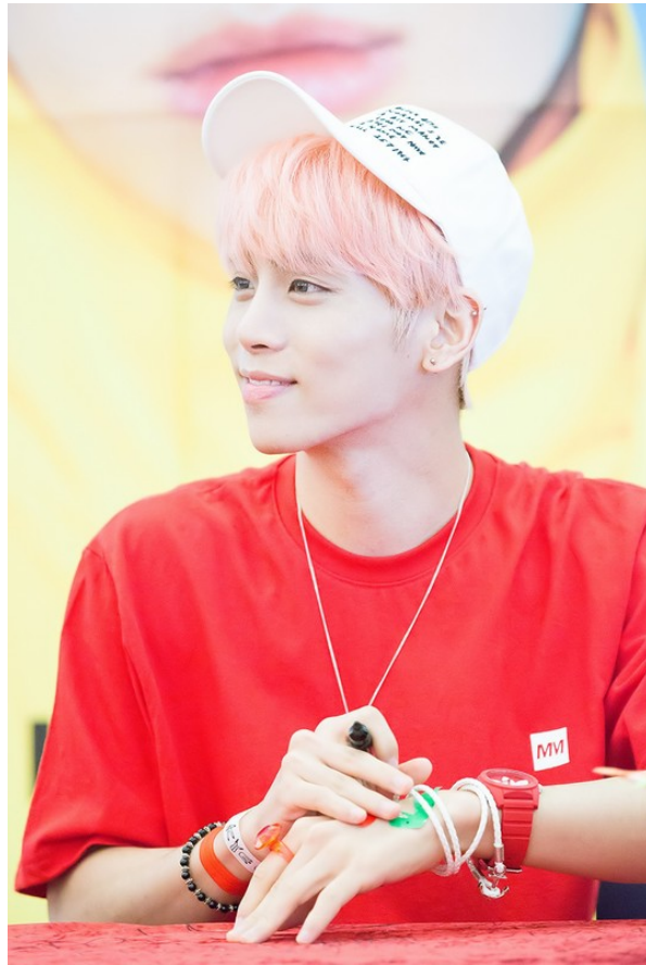
Jonghyun at a fan event in Busan, June 2016.