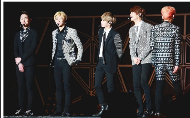
SHINee in performance in Taiwan, March 21 st , 2015 (SM Town Live World Tour IV). (l-r: Onew, Taemin, Jonghyun, Minho, Key).