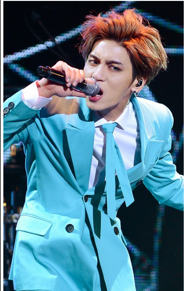
Jonghyun performing during the January 8 th , 2015 Base Showcase.

In K-pop, Beiber-esque misdeeds would virtually destroy an artist's career. 54 In the Korean media, idols' behavior can spark controversies and discussions around their "bad" attitude, which they might be accused of if, for example, they did not seem sufficiently sincere when greeting others, especially "senior" celebrities, on television programs. 55 Has an American star ever been castigated in headlines for failing to enthusiastically say hello to another star? Control over stars in this way is made possible precisely by the fact that the Korean spectators are considerably more homogenous than, for example, the North American media consumer, and generally share ideas of performed politeness. Furthermore, in Korea, there is significant inter-generational media consumption—a popular drama may achieve a 20% viewership rate—and K-pop is similarly viewed and listened to by young and old alike (albeit more passively by older generations). Outside Korea, the viewers and producers of a show like Duck Dynasty may have little overlap with the American who objects to Kendall Jenner's Pepsi ad or Roseanne Barr's tweets. Those celebrities can do things that cause vocal protests, but maintain a core fan base and find future work. However, the smaller and more tight-knit nature of the Korean media business means that once consensus turns against a star, it can be very hard to find someone willing to offer them a second chance.