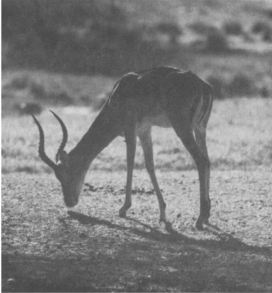
Left, top: Nyala. Left, bottom: Eland. Above: Impala.