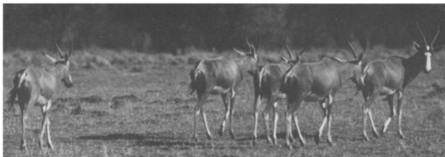
Blesbok ( R.A. Luxmoore ).

species may be sold in small numbers, often to the local hotel trade.