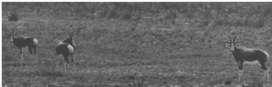
Bontebok (R.A. Luxmoore).

profit from game alone has led many farmers to attempt to stock the game at excessive densities, which has resulted in veld degradation on 19 of the 30 such properties in Natal (Rowe-Rowe, 1984).