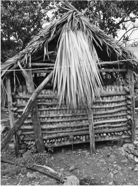
Figure 11.5 A maize granary in Yucatan, Yaxcaba, Mexico represents on-farm (or in situ ) conservation of crop diversity, 2013.

and providing genetic materials to breeding companies but providing opportunities and solutions to farmers and their farming systems. In this scenario, gene banks and breeding programs finally had a role in directly supporting farmers. 90