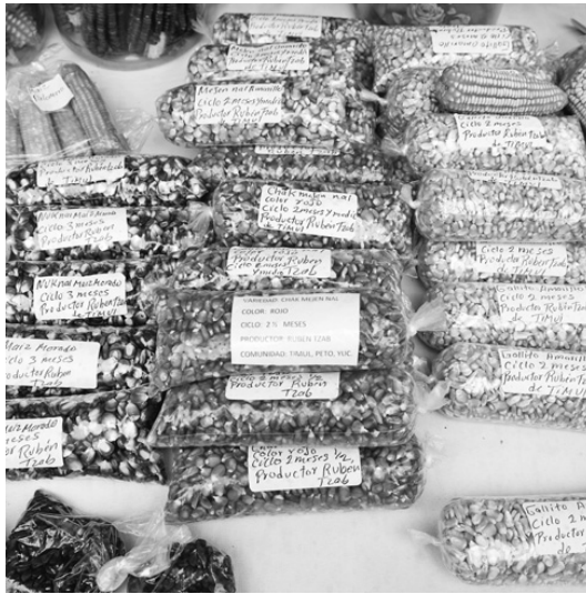
Figure 11.6 Maize seeds from a farmers' seed fair in Mérida, Mexico, 2014.

seeds and agrobiodiversity.” 91 Even though these principles are hardly fully translated into national agricultural policies, their declaration signals the important institutional changes driven in part by a shifting balance of power between different epistemic cultures in crop conservation and use alongside hard-fought political struggles. Many contemporary understandings of crop diversity contradict the long-dominant view of landraces as a stock of raw materials stored in “wild” landscapes. Because scholars have recognized farmers’ practices as important to the evolution, improvement, and conservation of cultivated biodiversity, institutions now confront the need to change seed regulations, as well as conservation methods.