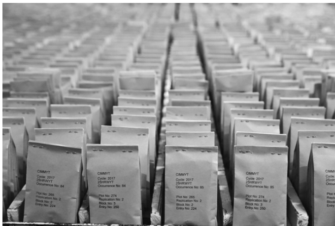
Figure 11.3 Accessions stored in the gene bank of the International Maize and Wheat Improvement Center (CIMMYT), Mexico, 2018.

Chapter 10, this volume), “minimum standard” protocols for plant exploration, and information-sharing activities. 42 These actions were directed by five ad hoc committees for the crops with the greatest economic importance: wheat, maize, rice, sorghum, and a single combined committee for millets and beans. 43 As Erna Bennett later reflected, these patterns confirmed that IBPGR followed the orientation dictated by the plant breeders’ epistemic culture: