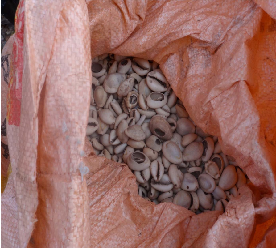
Figure 1. Cowrie shells in a sack ready to be taken to Papu, near Serekpere, as bridewealth.

exorbitant brideprice. Once the bridewealth has been transferred to and accepted by the bride's kin, the marriage union is formed and legitimated.