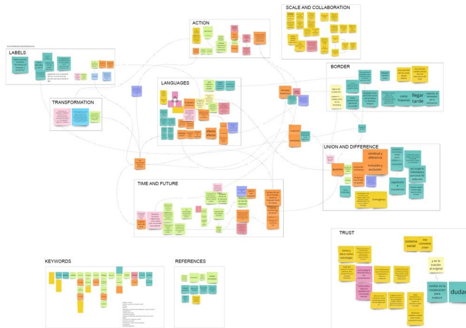
Figure 3. Collaborative board with overarching themes clustered and keywords selected