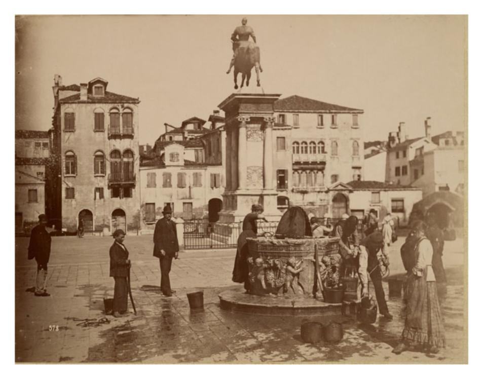
Figure 3. Public well (cistern), Venice about 1870–1880. Source: Giovanni Battista Brusa (Italian, active 1860–1880), photographer. The J. Paul Getty Museum. Public domain.