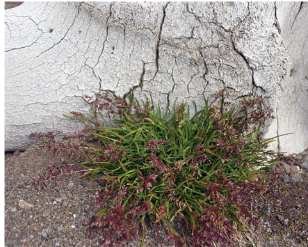
Fig. 2. A perennial tussocks which has been observed in the vicinity of Arctowski during several consecutive years.

Annual bluegrass can produce a huge number of seeds in very short time, even thousands per individual (Law 1981). Seeds can germinate even two days after fertilisation over a wide range of environmental con-