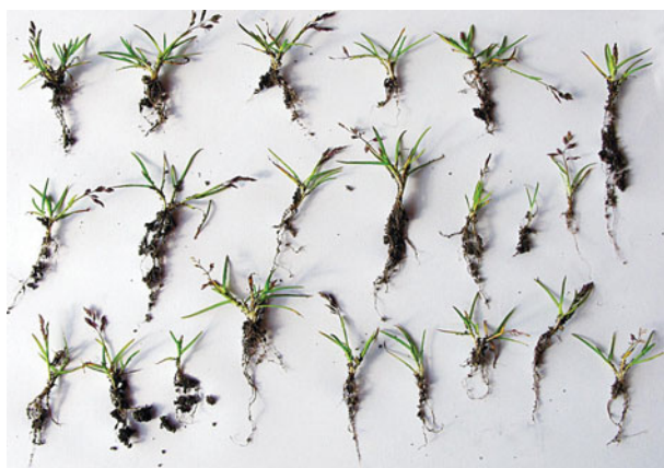
Fig. 3. Individuals isolated from one clump.

perennial ecotypes (Gibeault 1971). Therefore at least some of the clumps may be capable of surviving at least over several vegetation periods.