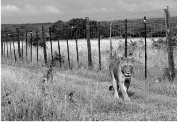
Plate 1 Reintroduced lioness with Phinda-born cub walking next to the electrified boundary fence of Phinda Private Game Reserve. The adjacent property is a mixed cattle and game farm.

lionesses F1 and F2 remained together for 692 days post-release until the death of F1. The adult lioness F8 remained with two unrelated sub-adult females F9 and F10 for 55 days until they killed a tourist and were removed. A coalition of male lions comprising two brothers M11 and M12 and one unrelated male M13 remained intact for 516 days, when one of the brothers was killed in a snare. M12 and M13 remained together for a further 80 days until the death of M13. Finally, the unfamiliar half-brothers M88 and M89 (sired by the same male to unrelated females in separate reserves) have remained together for 730 days at the time of writing. There was no significant difference in the index of association between related and unrelated animals that remained together after release (Table 2; females, Mann-Whitney U-test, z = 1.76 , P = 0.078 ; males, Mann-Whitney U-test, z = -1.62 , P = 0.105 ).