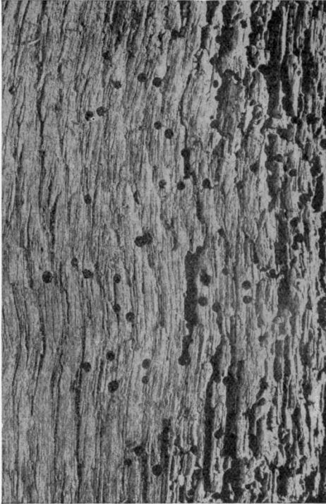
FIG. 3. Holes of the Furniture Beetle (natural size)

Then, late in the third summer, they tunnel out to very near the surface and become the chrysalis. From this, in the same autumn, develops the beetle which normally only