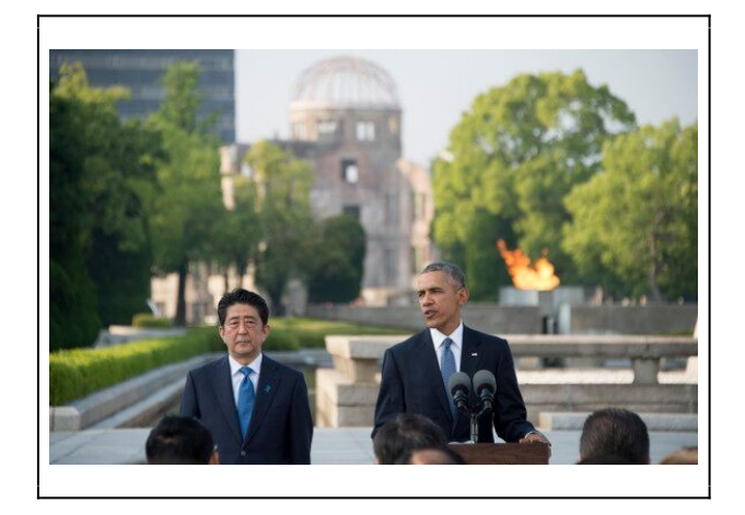
In May 2016, US president Obama and Japanese Prime Minister Abe stood together at

Following the 2014 Vienna Conference on the Humanitarian Impact of Nuclear Weapons, a "Humanitarian Pledge" outlawing use of nuclear weapons was by August 2015 endorsed by 159 countries. <sup>19</sup> Japan (and Australia) stood apart, calling instead for a "progressive approach" that would be acceptable to the nuclear powers, i.e. to the United States. <sup>20</sup>