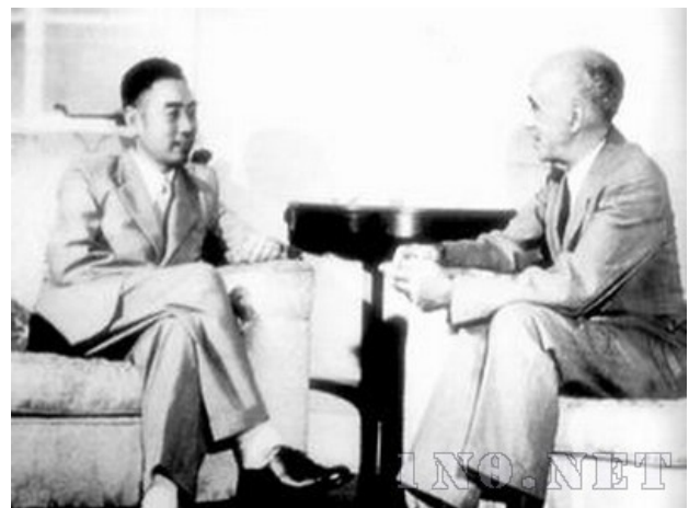
John Leighton Stuart and Zhou Enlai, 1945

The Pacific War destroyed the Open Door Raj; Japan's defeat changed China's agenda back to what it had been in the 1920s: nationalism and anti-imperialism. When he was named Ambassador to China, he could speak Chiang Kai-shek's Zhejiang patois but Stuart could not get the Nationalists to reform or negotiate a settlement with the Communists, a number of whose leaders were Yenching graduates. In the end, his insider status and American power were irrelevant.