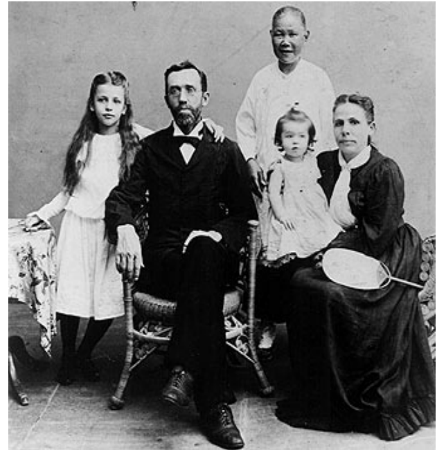
Buck at home in Zhenxiang as a child