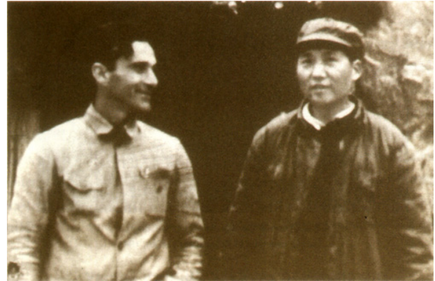
Snow and Mao Zedong in 1936

Edgar Snow and Pearl Buck did not fare much better. Snow moved to Switzerland and continued to write about China, returning to China in 1960 and then for the last time in 1970. Buck was suspect because of her racial liberalism and anti-imperialism but generally moved on to less provocative (and more lucrative) topics. With the Korean War in mind, she wrote in her 1954 memoir, My Several Worlds : "Over and over again in recent years Americans have said to me with real sadness that they cannot understand why the Chinese hate us 'when we have done so much for them.' Actually, of course, we have done nothing for them. They did not ask us to send missionaries nor did they seek our trade." [7]