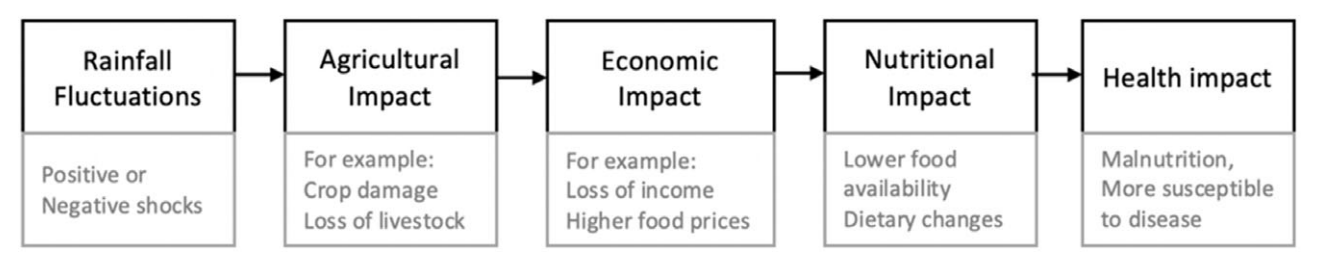
Figure 3. Theory of change.

In Pakistan, there are two main growing periods during a typical agricultural year. These are Kharif (meaning autumn) and Rabi (meaning spring). Kharif crops are typically grown during the summer months and harvested during the autumn months, while Rabi crops are generally cultivated during the winters and harvested during spring. Thus, the Kharif season normally runs from April to September, while the Rabi season extends between October and March with regional variation in the precise onset of the Kharif and Rabi season. The precise duration of each season varies across as well as within provinces, depending upon the area and the crop being planted.