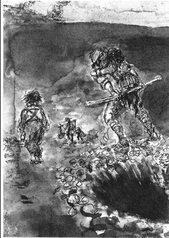
A woman who lost her legs is carried by a Japanese soldier.

Moving by night in search of a shelter, we came under heavy enemy fire and dropped down for cover. As usual, when it let up, we checked with each other to make sure everyone was all right. Our family was safe, but a woman we didn't know who'd begun traveling with us had fallen into a shell hole just gouged in the ground. She was screaming and writhing in pain. "My daughter is waiting for me in the forest. Take me to her!" she begged. Then we saw she had lost both her legs. We all felt sorry for her, yet by this time no one had the strength or will to do anything but save themselves, not even to help her out of that shell hole. A Japanese soldier who just happened to be passing by lifted her legless body onto his back, and resumed walking using his army sword to hold her in place. Shredded pieces of flesh and gobs of blood fell from her torso, staining his uniform and gaiters a dark red. She continued saying that her daughter was waiting in the forest as the soldier carried her along until she fell unconscious and stopped breathing. It must have given her comfort, as she rode on that soldier's back, to hope that she would be able to see her daughter again.