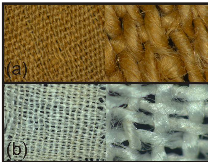
Figure 2 Linen sample OZK371 (a) before treatment at 6× and 32× magnification and (b) after pretreatment at 6× and 32× magnification.

A clean segment of each linen sample was subsampled for dating, then treated to remove contamination. While the samples were deliberately taken from inside the wrappings close to the mummy and therefore protected from external contaminants, possible contaminants include substances associated with the embalming process such as resins, oils, waxes, spices, wine, and ancient salts. Due to the nature and the uncertainty of the sources of contamination, extensive pretreatment was performed to remove contaminants. Approximately 95 mg of fabric was removed from clean sections of the linen; these were then pretreated using an extensive series of solvent extractions followed by an oxidizing treatment used for extraction of holocellulose. Solvent extractions comprised Soxhlet extraction for 2–3 hr each with toluene, dichloromethane, methanol, and water; these were then followed by washings with diethyl ether, acetone, and finally thoroughly washed with deionized water. Holocellulose from the linen was then obtained by bleaching with 1% sodium chlorite in HCl (1M) for 2 hr at 80 °C; the fabric was then washed thoroughly with deionized water and dried at 60 °C (Hua et al. 2000). The appearance of the linen before and after pretreatment was examined under the microscope to determine the efficacy of the cleaning process (Figure 2).