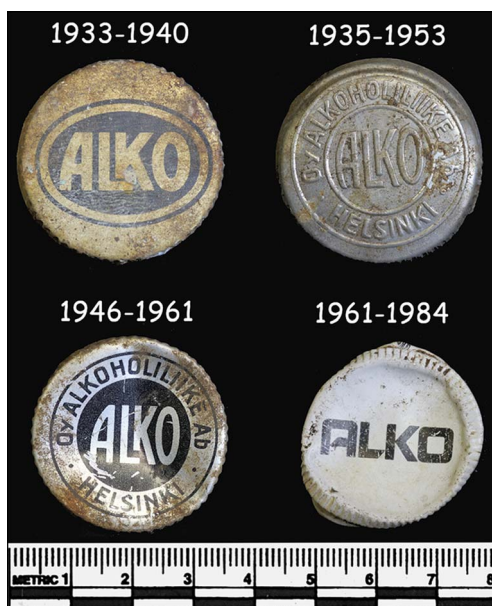
Figure 6. The 'bottle-top chronology' with finds from Vaakunakylä.

but, based on our contemporary archaeological explorations, alcohol bottle tops are among the most common finds in all twentieth-century contexts in Finland. We can trace what was consumed in different households based on the bottle tops and they also serve as horizon markers. We have established in our research a 'bottle-top chronology' based on the finds from Vaakunakylä that works as a tool for dating twentieth-century sites across Finland (Kelloniemi 2023) (Figure 6).