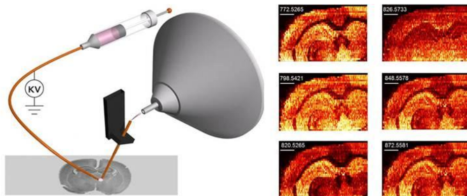
Figure 1. The nano-DESI setup and images of some phosphatidylcholine species, PC 32:0 ( m/z 772.5265), PC 34:1 ( m/z 798.5421), PC 36:4 ( m/z 820.5265), PC 36:1 ( m/z 826.5733), PC 38:4 ( m/z 848.5578), PC 40:6 ( m/z 872.5581). Scale bar shows 2 mm.

cultivated on A+ agar with high salt content (~300mM). Since nano-DESI does not require any sample preparation, chemical gradients of metabolites being produced by Synechococcus sp. PCC 7002 colonies were profiled on living colonies cultivated on A+ agar. The results show the evolution of metabolite gradients of glucosylglycerol and sucrose, generated on the agar over a time course of 6 days and demonstrate the unique power of nano-DESI for chemical characterization of living microbial systems.[4] [5] (Figure 2)