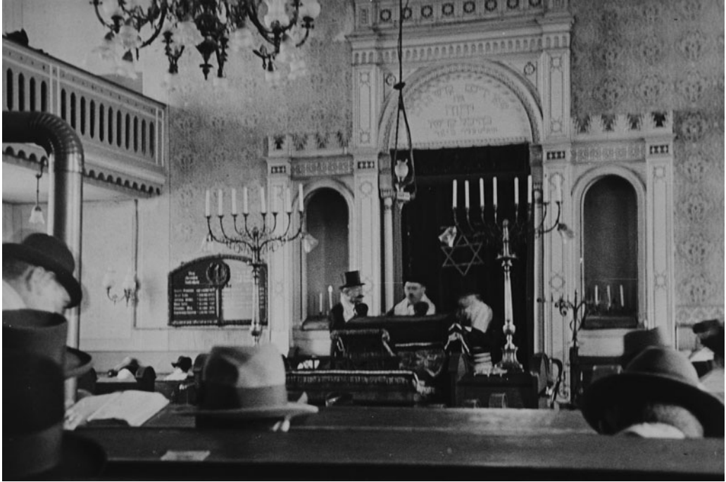
Figure 7. German Jews gather for Sabbath morning prayers in the synagogue in Breisach.