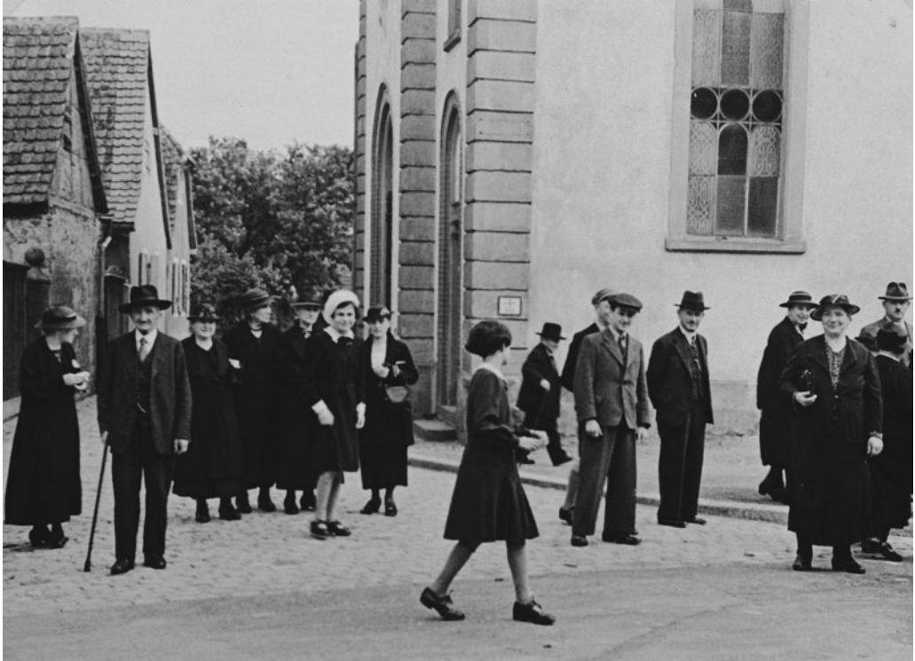
Figure 5. German Jews congregate on the street outside the synagogue in Breisach following Saturday morning services.

anymore. Thus, while they aimed to show continuity in their routines, despite everything that was happening around them, they sought to document their lives and their community precisely because of the dramatic changes that the community faced. This tension also goes some lengths toward explaining the desire of those in the photos outside the synagogue to look to the camera and have their presence and faces recorded.