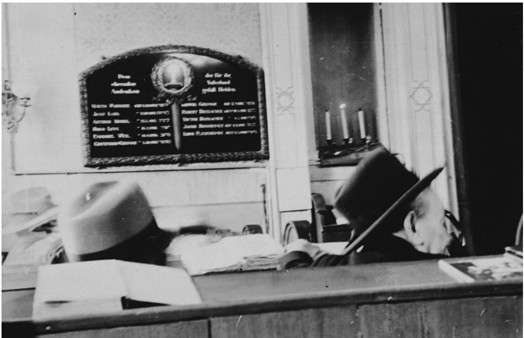
Figure 8. German Jews gather for Sabbath morning prayers in the synagogue in Breisach. (German-Jewish men seated during prayer services in the synagogue in Breisach. In the background, on the wall, is a plaque commemorating the fallen community members who died 'as heroes of the Fatherland' during the First World War.)