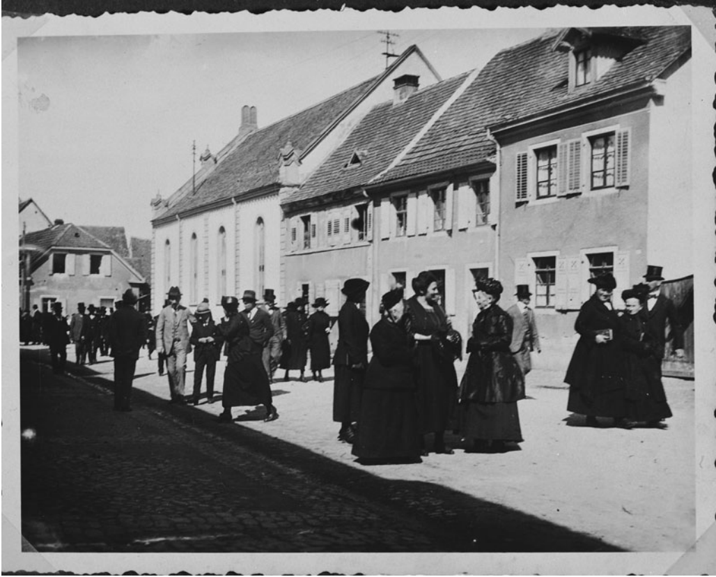
Figure 4. German Jews congregate on the street outside the synagogue in Breisach after Saturday morning services (taken in the early 1920s by Jakob Greilsamer). United States Holocaust Memorial Museum Photo Archives #69570. Copyright of United States Holocaust Memorial Museum.

photo taken more than a decade before (see Figure 4 ), is that most individuals appear to make eye contact with the photographer and several clearly smile in his direction. To be sure, smiling for the camera had become such a simple reaction that it would have been an almost automatic response for many of those who saw Bähr with his camera in hand. Yet, enough photographic collections by German Jews during the National Socialist era demonstrate the frequency by which seemingly normal routines were used as defiant displays of private happiness in the face of worsening conditions in the public sphere. 59 If we assume that the objective of both photos – the one taken before 1925 and those taken by Bähr in 1937 – was to document the ‘normal’ routines of the community, then the effect of normality was achieved in the earlier photo by looking away from the camera and focusing instead on displaying authenticity by acting as if no camera were present. In Bähr’s photos, in contrast, normality is achieved by acting out daily routines in conjunction with established conventions of photography, including posing and smiling for the camera.