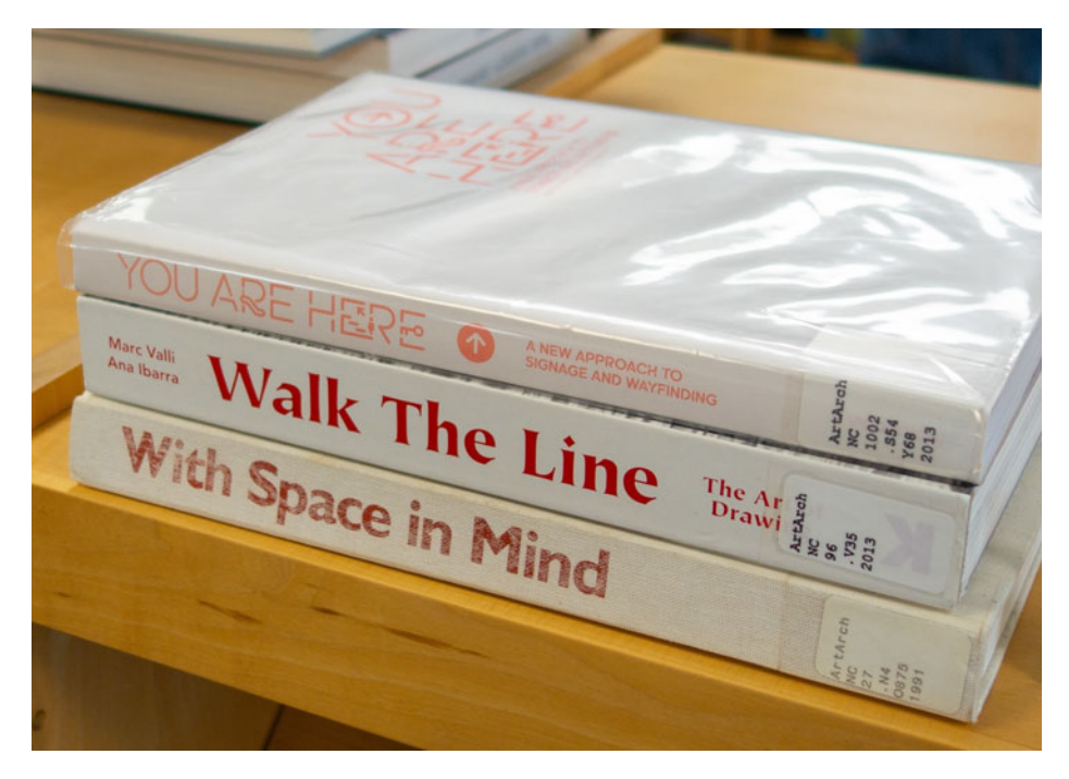
Fig. 2. Student three, book spine poem, "You are here, Walk the like, With space in mind."

This student's drawing was a landscape. Large rocks dominated the pictureplane and, on one of the rocks in the foreground, sat a single frog looking to the horizon. The drawing was done in graphite and had an intentional coolness to it that lacked any expressive mark-making. The student had already started working in landscape prior to this drawing but their landscapes were typically pastoral, focusing on the depiction of pleasant views. With this drawing they began to see the landscape as a means for expressing concerns about nature and how we live within it. The poem made them reconsider what they could express through their subject and served as a tool for moving them beyond the more obvious and acceptably conditioned tendencies a student would typically gravitate toward. The student went on to build their entire body of work for the semester from this one drawing, and those drawings later served as the basis for their thesis