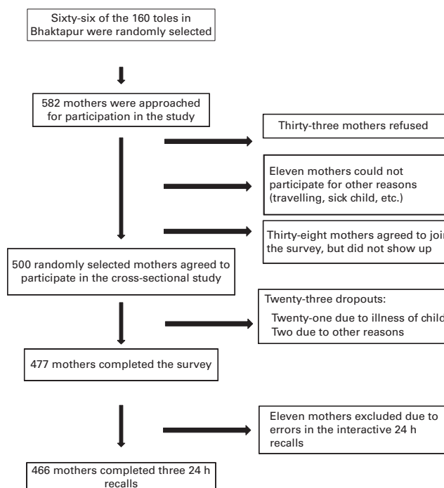
Fig. 1. Flow chart of the recruitment of the study subjects.

Women came to the hospital to receive physical examinations, dietary interviews and blood draws. The first woman was enrolled in January 2008 and the last in February 2009. The inclusion criteria were that they were lactating, had no