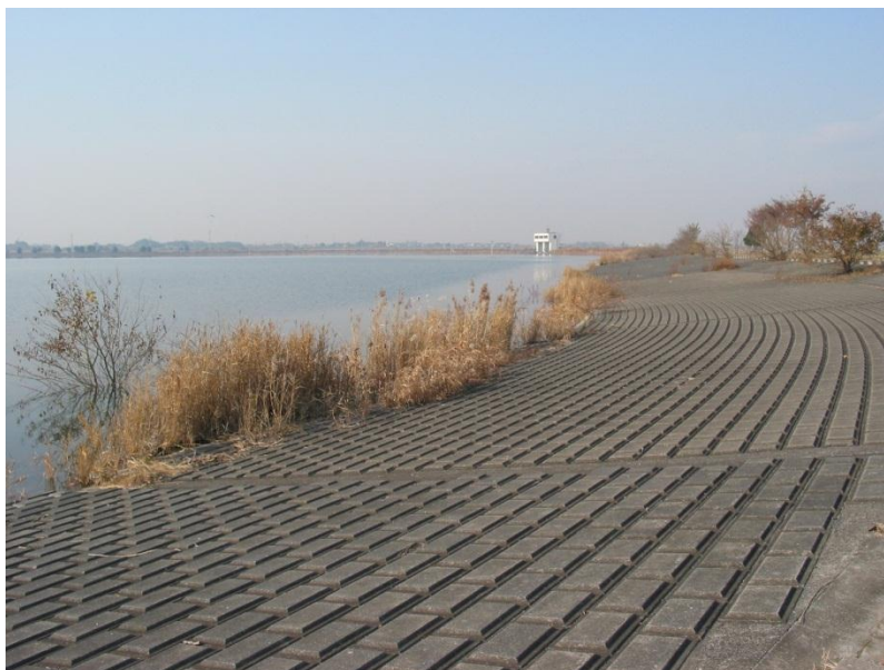
FIG. 6: Concrete bank of the Yanaka Reservoir, 2002.

Given this history, it is interesting to note the discourse on dams in modern Japan where new construction or removal maps so closely to bureaucratic initiatives, on the one hand, or citizen-led ones, on the other. From former Nagano governor Yasuo Tanaka's "Dam Removal Declaration" ( Datsu damu sengen ) to the citizens' groups forming in opposition to the Arase and Nagara dam projects, the convergence of river policy and political and social movements remains strong. Outside Japan the saga of dams and displacement continues on an even larger scale. Like Tanaka's warnings nearly one hundred years earlier, Arundhati Roy's The Cost of Living (1999) takes on the "illusions of India's progress" in a polemic against the massive dam projects in the Narmada valley as India strives toward Great Power status—which today means not only large nature-transforming projects but also means the risk of unleashing the ultimate doku : nuclear weapons. [12]