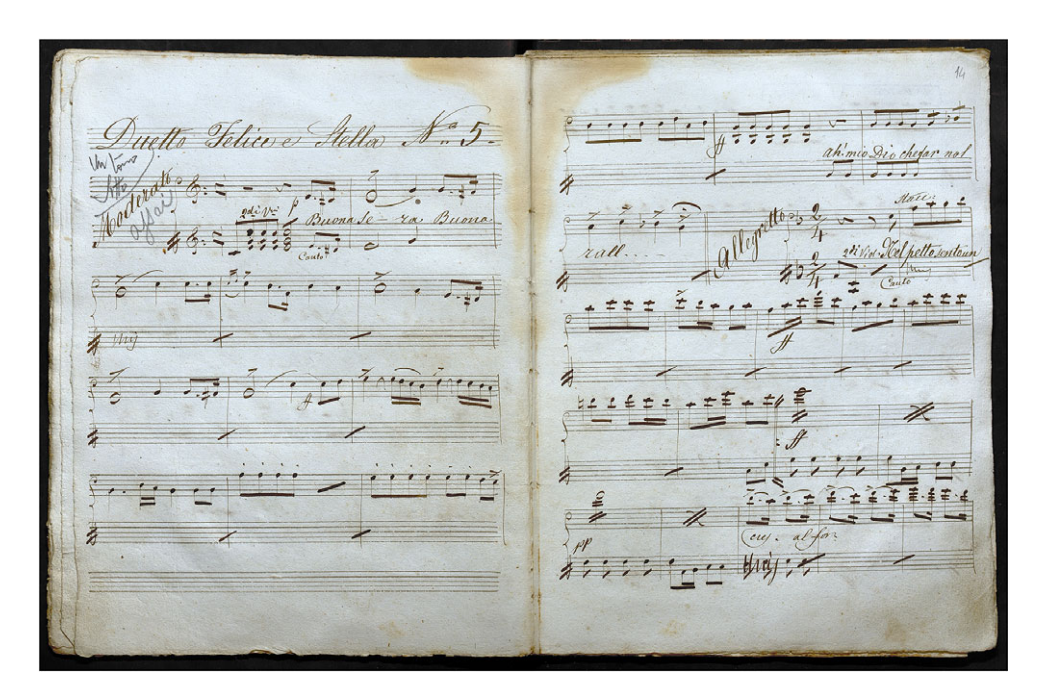
Figure 1. Gaetano Scognamiglio, Na santarella (1889). Extracts from surviving piano-vocal score: Act I duet between Felice and Stella. Biblioteca Lucchesi Palli, Naples.