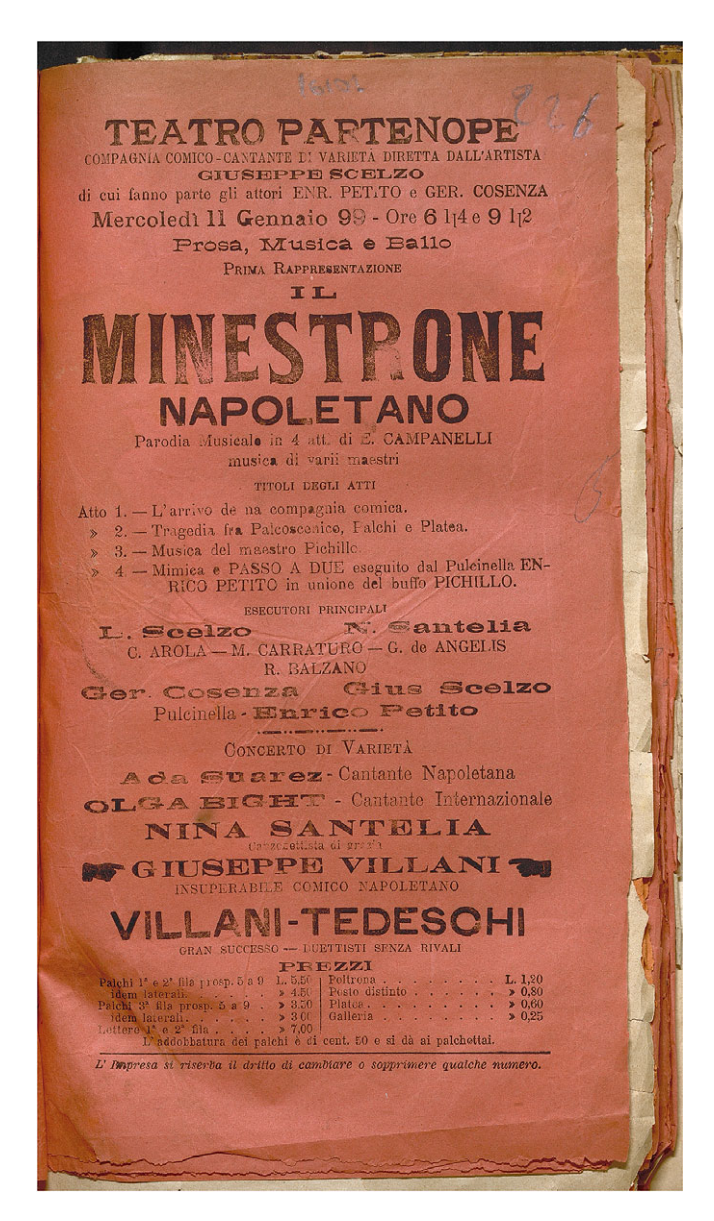
Figure 2. Il minestrone napoletano, playbill. Programmi Teatrali, Biblioteca Lucchesi Palli, Naples.

fascination with signification, and positioned commedia dell'arte figures as at once historical and socially and artistically disruptive. Tellingly, pantomime was a genre that Costa also explored when he composed L'histoire d'un Pierrot – the first of several prominent non-vocal works that included the ballet Bella Napoli (1907) – bringing together Parisian and Neapolitan practices at the Parisian venue that had once hosted Hervé.<sup>53</sup> The 'Sérénade de Pierrot', a waltz played on the mandolin, is a recurring theme and the Neapolitan quality returns in the