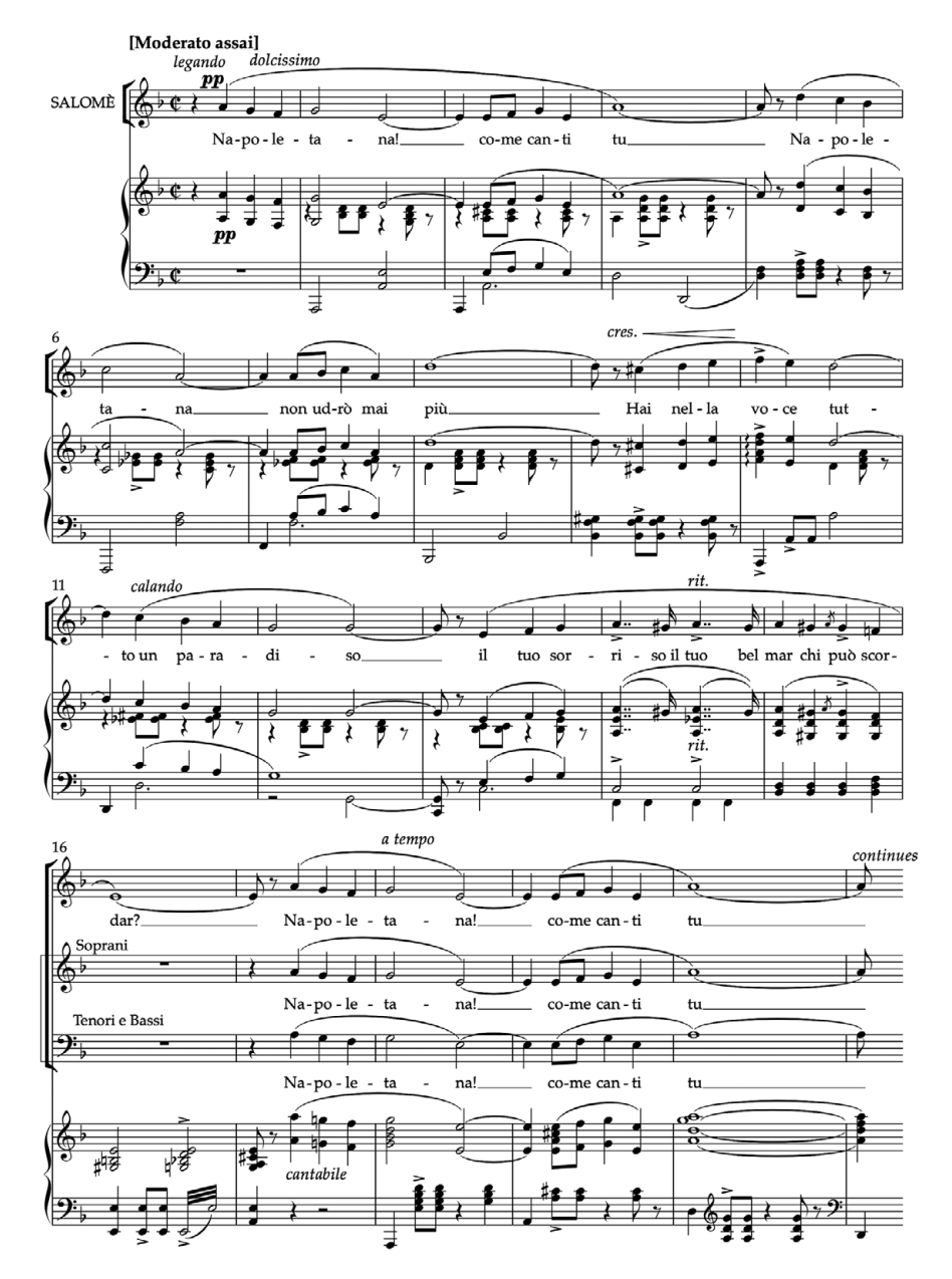
Example 1. Mario Costa, 'Fox trot della scugnizza', Scugnizza, piano-vocal score (Milan, 1922). (Minor engraving errors corrected without comment.)

with an international and global marketplace. <sup>111</sup> Where Mamma Angot al Costantinopoli had tied Neapolitan song to French operetta in a Turkish context, Scugnizza directly acknowledged the new musical and economic superpower.