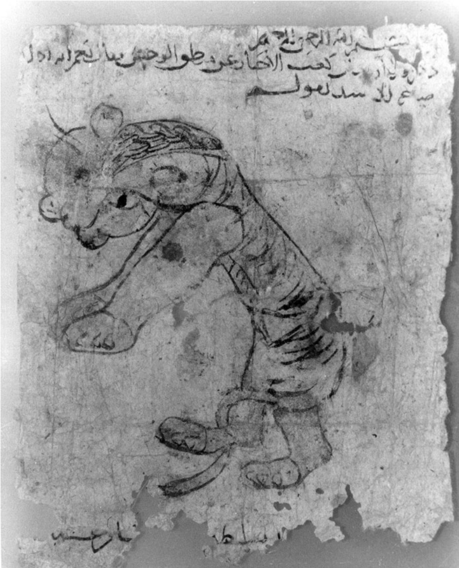
Figure 2. Painting of a lion on paper, 15.72 × 12.06 cm. Bought from Michel Abemayor, 1954.

look like a preparatory study for something else, so its purpose remains a matter of speculation. 24 And the drawing in the British Museum (see Figure 5) that Ettinghausen cited in the 1940s as Fatimid has now been attributed to the Ayyubid period (that is, after 1171) on the basis of the shields depicted. 25 While there is no possibility of establishing the provenance of