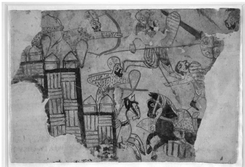
Figure 5. A battle beneath the walls of a town. Painting on paper, 21 × 31.4 cm. Purchased from Major H. Howard, 1938. Source: London, British Museum, 1938, 0312.0.1. © The Trustees of the British Museum.

to the urban realm. 26 Unfortunately, the few signed ceramics show that figural representation was an integral feature of Fatimid lustre pottery from the beginning, and the two datable pieces—one abstract, one representational—are associated with courtly patrons. 27 Current research suggests that the representational pieces are actually earlier than the abstract ones! As Ettinghausen and Grube already noted, some representations seem to develop from those on earlier Abbasid lustrewares, while others seem to derive from Hellenistic and eastern Christian traditions of representation and draftsmanship which apparently continued to be practised in Egypt in early Islamic times. 28 The variety of representation is extraordinary—traditional subjects like animals, hunters, musicians, dancers, entertainers, and rulers, as well as “new” subjects like wrestling, cock fights, rope dancing, or duels—although the question of whether these representations are “realism” or “formalism” remains open. 29