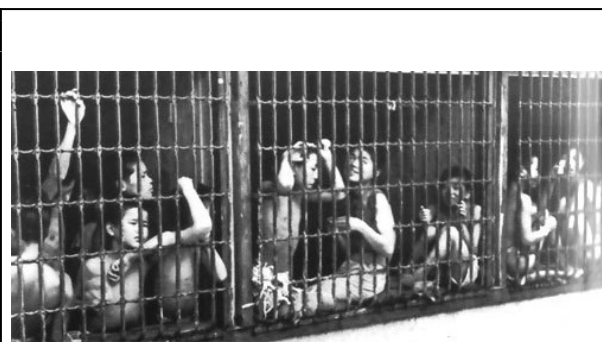
Children caught and detained through

There was another "problem" with this figure of 123, 511: children of broken and/or impoverished families, whose parents were alive, may have been included in the number "by mistake," largely because they were on the street just like sensō koji . They were called furōji [juvenile vagrants]. For the postwar government, it was essential to separate furōji from sensō koji , because the former were suspected of disturbing public peace and social order. The editorial of the journal Shakai Jigyō [Social Work] published in 1946 insisted that most furōji (浮浪児) had already become furyōji (不良児), that is, "juvenile delinquents." In the same journal published in 1948, Takeda Toshio, a social worker, wrote, "Even though we call them sensō koji , more than 40 percent of them have already become furōji (1948: 1). These reports created what I call sensō koji-cum-furōji . They were "hunted, rounded up and captured" ( karikomi ) by the police, and sent to shelters, prisons or relatives (if any were willing to accept the child). 11 However, many quickly ran away from those facilities, and returned to what Yoshioka Genji later called "the land of freedom," the places they inhabited before being captured (1987). The reports indicated that sensō koji-cum-furōji committed such crimes as theft, pilferage, embezzlement, arson, black-market trading, gambling, prostitution and consuming and selling illegal drugs. 12