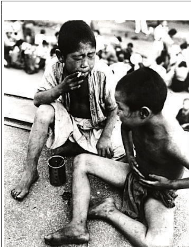
Sensō koji smoking at Ueno.