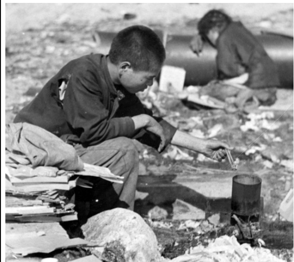
Sensō koji in Kita-ku, Osaka, using an empty can to cook.

selling food coupons, begging (Dower 1991: 63).