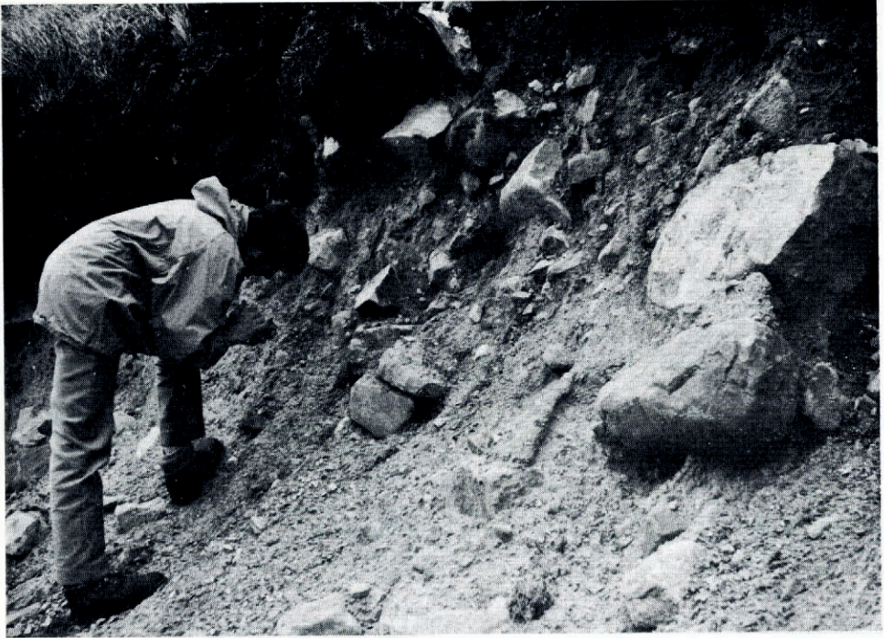
Fig. 3. Detail of the till deposit at an altitude of 200 m in Double Stream Basin. Some of the stones are striated.