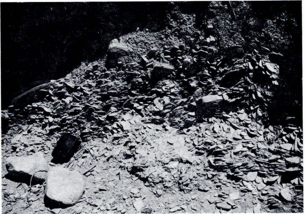
Fig. 4. Detail of the 7 m raised beach deposit as exposed on the shore of Port Howard.