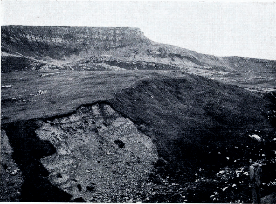
Fig. 2. A 25 m thick section in the till deposit at an altitude of c. 400 m in Double Stream Basin. The cliffs of one of the cirques can be seen in the background.

glacial action. It therefore seems from the available evidence that when glaciers were present in the Falkland Islands the two glaciers emanating from the cirque complex of Double Stream Basin were no more than 2.5 km and 2.7 km in length, respectively.