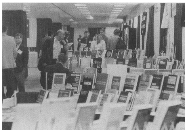
The 1999 Exhibit Hall featured over 150 exhibitors from the U.S. and around the globe.