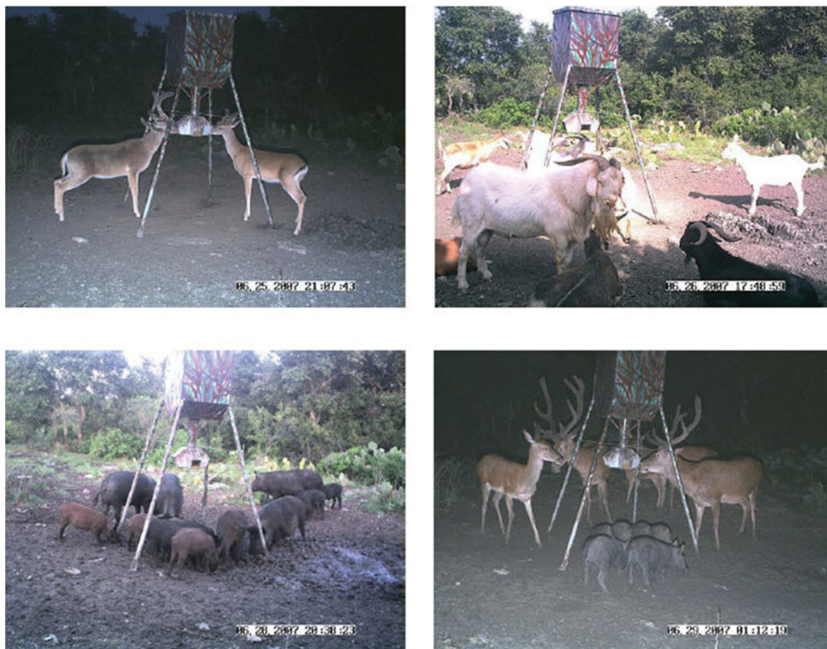
Fig. 2. [colour online]. Examples of livestock and wildlife use of a protein feeder in South Texas.

parts of the South and Midwestern United States [64]. This often controversial industry is thought by some to pose a risk for introducing and establishing additional foci of endemic wildlife diseases, including M. bovis [65]. In some locations, exotic hoofstock or native Cervidae are released or baited into a semi free-ranging environment for recreational hunting. There, the animals often mix with cattle and feral swine (Fig. 2), creating an environment for pathogen exchange [66]. Some livestock producers have boosted incomes by combining exotic and native hoofstock game ranching with traditional cattle production; others have replaced cattle with exotic or native hoofstock ranching as a new form of animal agriculture.