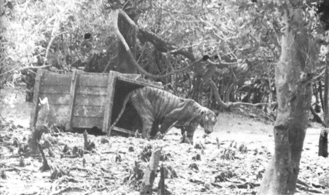
Leaving the transfer cage in the mangroves

hury, asked Lahiri, Das and Seidensticker to return to the site, where we arrived at midday on September 1st. We found the tiger dead in the mangroves, 20 metres from the transfer cage. There were numerous tiger tracks around both the cage and the carcass, and the freshest tracks, which had been made in the few hours before the last high tide, and many of the older ones were larger than those of the dead tiger. The carcass was already badly decomposed. The right side and abdomen had numerous maggot-infested puncture wounds, the thoracic cavity had puncture wounds, and there were multiple puncture wounds in the hips and right shoulder. Only the extremities had been fed on by scavengers. A small monitor Varanus salvator ran away as we approached. No other large predators occur in this region, and we could only conclude that this tiger had died of injuries resulting from an encounter with another tiger.