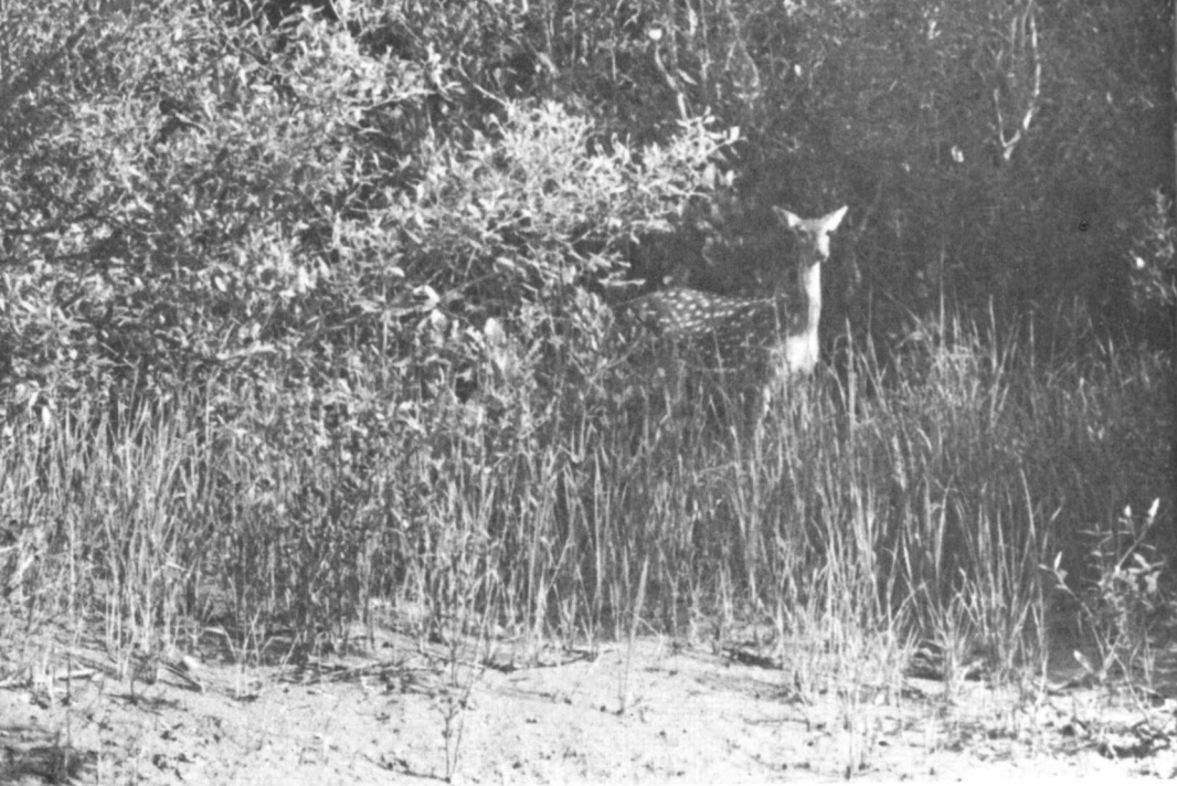
AXIS DEER near the tiger's release point

in the dark, making a night darting necessary, so we built a 15-foot-high machan 100 feet away for a spotlight.